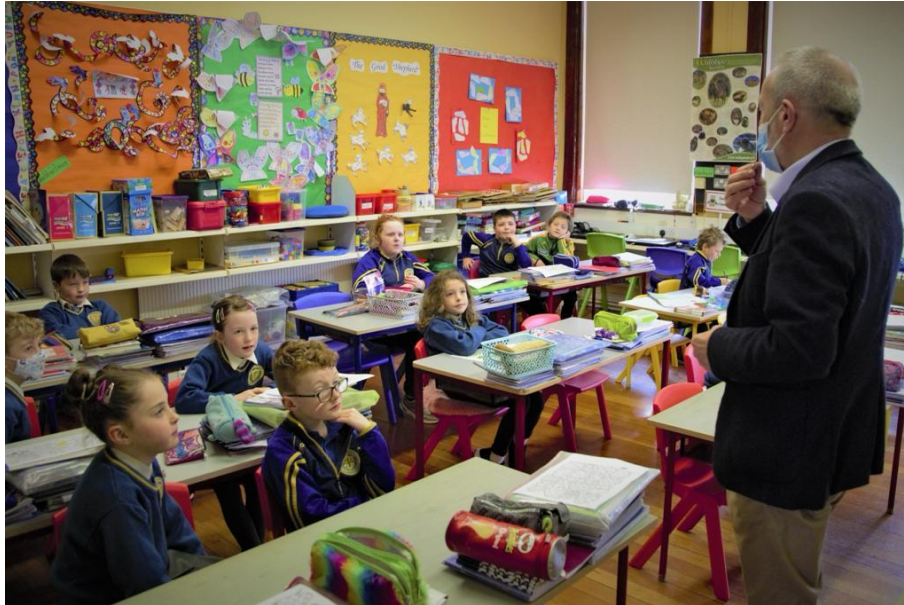
Seán Kelly MEP visiting Loughfouder N.S., in person VIP Visit.

Blue Star Programme schools were asked to submit a form when a visit, whether virtual, in-person, or through the Pen-Pal system, took place.