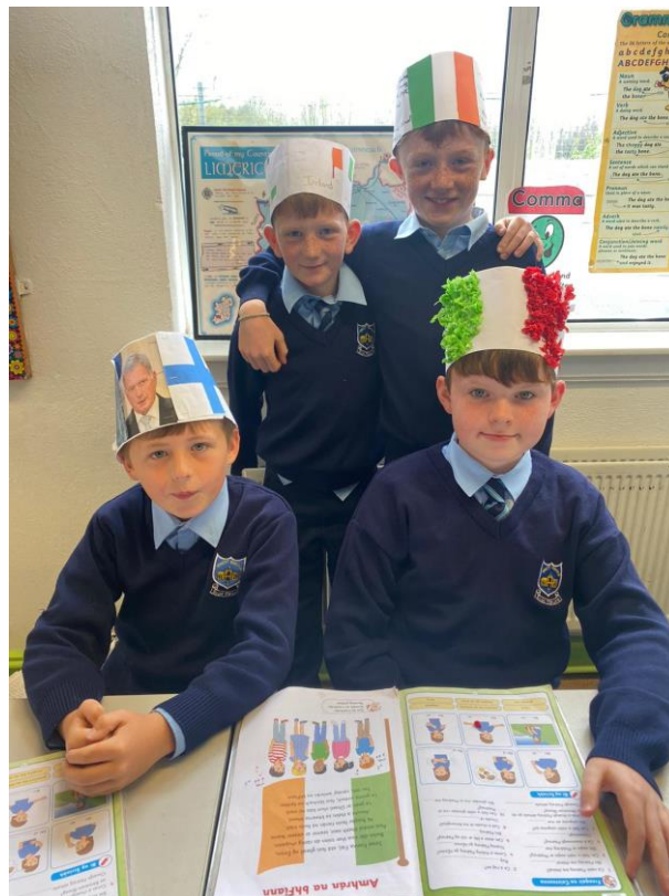
Pupils at St Mary's BNS celebrating Europe Day/.

On 9 May 2022 we encouraged teachers to mark Europe Day and schools did this by holding events such as the 'Handshake for Europe'. The traditional 'Handshake for Europe' symbolises the solidarity among European citizens and celebrates the diversity of a strong and inclusive Union. Schools also held a variety of other events, such as 'Dress-Up Days' where pupils were asked to dress up in European-themed outfits.