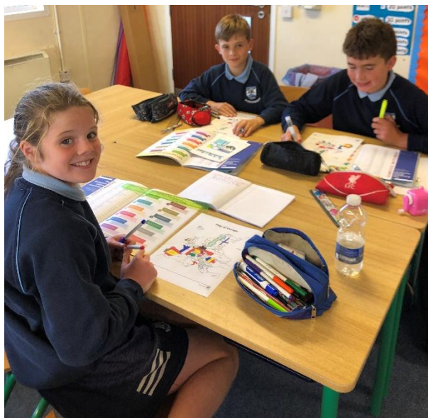
Pupils from Rush National School using their Blue Star Programme resources to learn about European History.

The broad scope of the Blue Star Programme meant that pupils were able to focus on a historical theme appropriate to their age and class. In this way, the Programme afforded teachers the necessary flexibility to adapt it to suit their requirements and curriculum. Pupils completed the 'Historical Element Quiz' which is part of a wider method of completion to the Blue Star Programme, introduced in 2021.