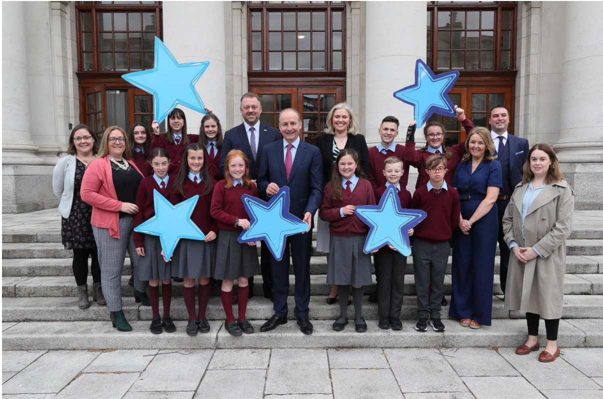
Pupils from St Andrew's NS, Currigha with An Taoiseach Micheál Martin TD, Minister of State for European Affairs, Thomas Byrne TD and Blue Star Steering Committee Representatives, celebrating Europe Day and Ireland's 50 th Anniversary of voting to join the EEC.