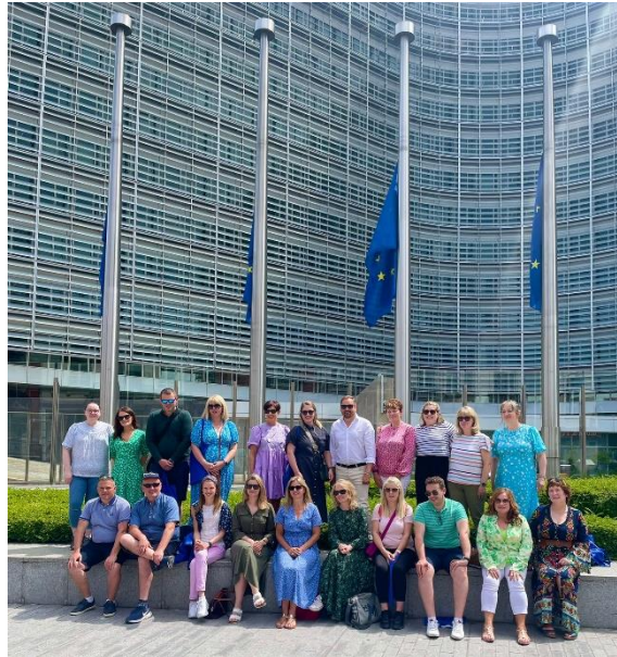
Teachers taking part in the Blue Star Programme trip to Brussels outside the European Commission.