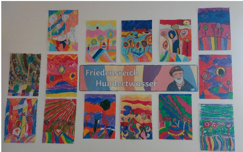
Pupils' artwork inspired by Austrian artist, Friedensreich Hundertwasser from Mullingar Educate Together National School