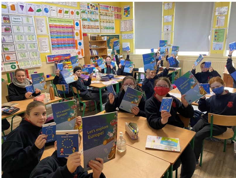
Shanahoe NS with their 'Let's Explore Europe' one of the Blue Star Programme teaching resources.

The Blue Star Programme also issued Media Consent Forms when schools registered, to allow for permission to share photos or videos of the pupils and their work. EM Ireland is committed to practices which protect children from harm. We also recognise that good child protection policies and procedures are of benefit to everyone involved in the Blue Star Programme.