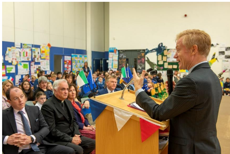
French Ambassador to Ireland visiting Scoil Nioclais, Cork to mark the 50 th Anniversary of Ireland voting to join the EEC.

Europe Week and 'Ireland EU50' celebrations took place throughout the week of 9-13 May in primary schools across the country with many Government Ministers and EU country Ambassadors visiting Blue Star Programme schools. During Europe Week over 30 schools were visited by Government Ministers and EU country Ambassadors.