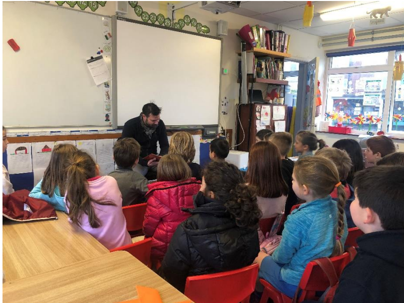
French Restaurateur reading a book in French to pupils in Kildare Place School.

This year, EM Ireland continued to encourage schools to broaden the scope of potential VIP visits to include student teachers from other EU countries through the eTwinning programme, as well as the involvement of past pupils and parents whose work is related to Europe. In the future, EM Ireland would encourage schools to also explore the potential for such visits to facilitate foreign language learning through presentations from native speakers from other EU countries.