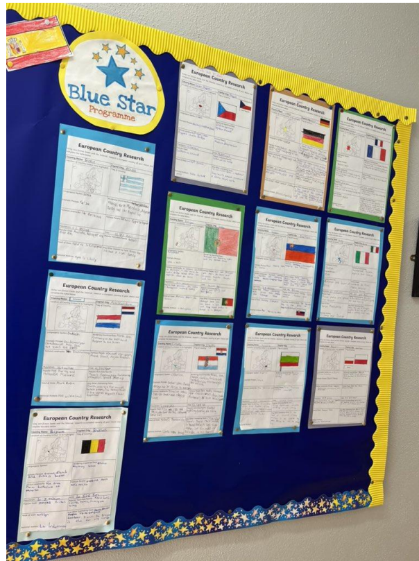
European Country Fact Files from pupil from St Colman's NS.