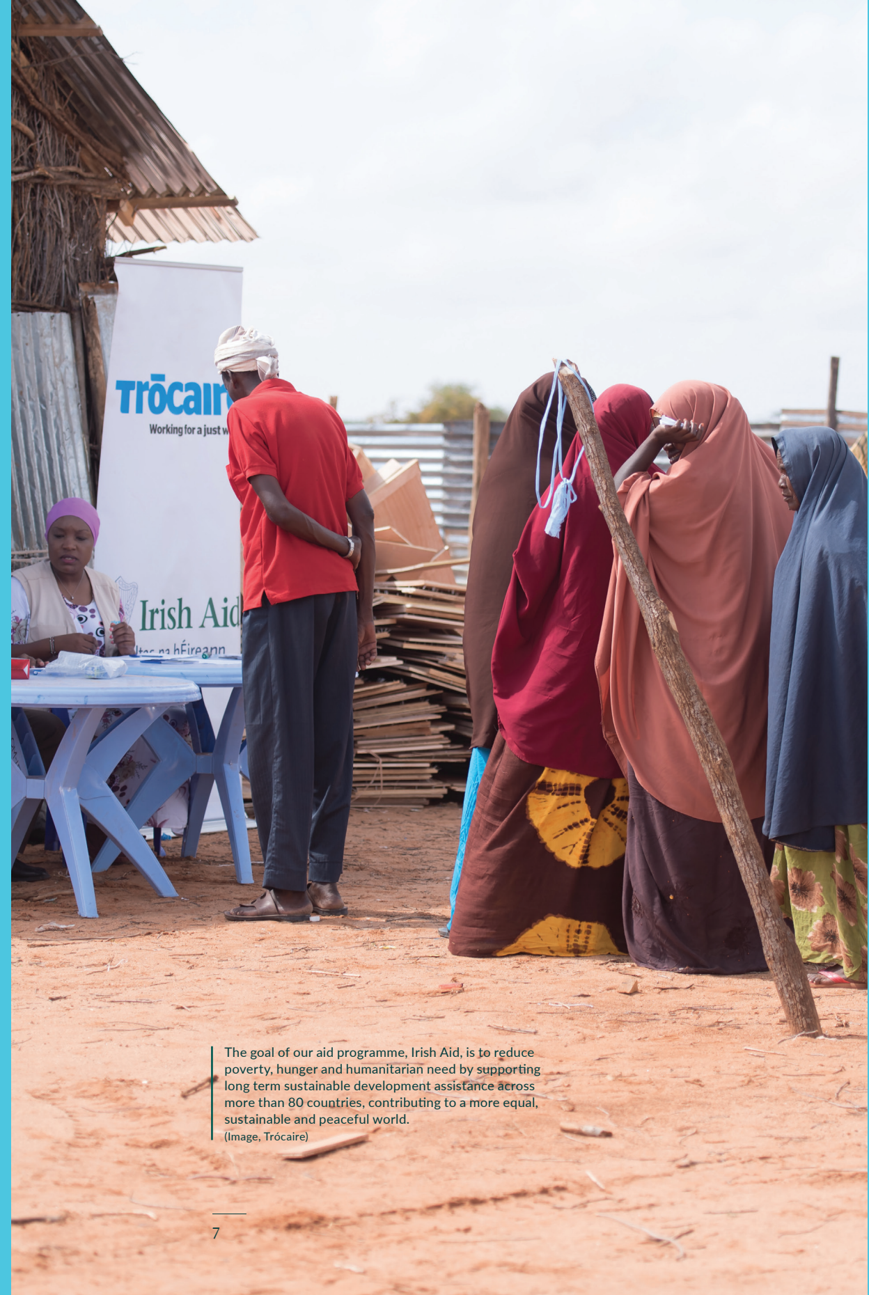
The goal of our aid programme, Irish Aid, is to reduce poverty, hunger and humanitarian need by supporting long term sustainable development assistance across more than 80 countries, contributing to a more equal, sustainable and peaceful world.

Our leadership on the Sustainable Development Goals and our commitment to climate justice are expressions of that partnership. Ireland's focus is on those furthest behind, including continuing commitment to support Least Developed Countries. Women and Girls are very often furthest behind, that is why we shine a light on them and work hard to promote and protect their human rights.