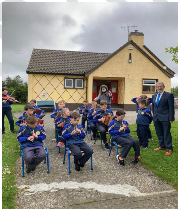
Seán Kelly MEP visiting Loughfouder N.S., on his first in person VIP Visit in a year.

In terms of the number of VIP visits that took place during the 2020-2021 Programme, due to school closures as a direct result of Covid-19, the majority of VIP visits this year took place remotely, either through the Blue Star Programme's 'Pen-Pal' initiative or as a virtual visit using an online platform. At least 10 schools took part in the 'Pen-Pal' initiative while a further 7 schools held