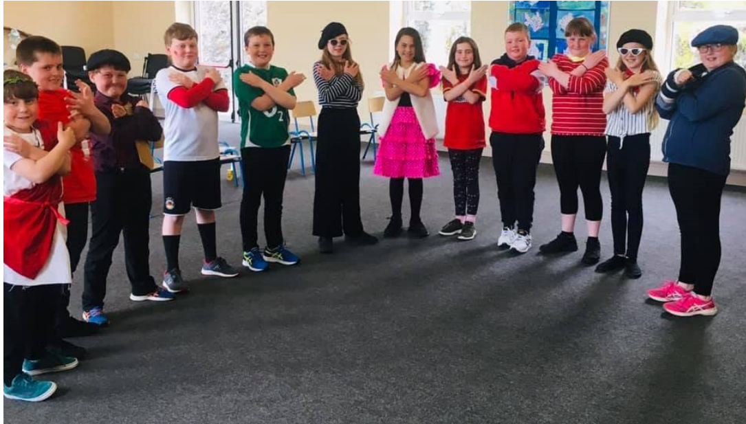
Pupils at Kilcoe N.S., taking part in this years' 'Air Handshake for Europe' initiative.