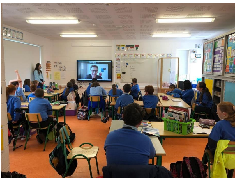
Maria Walsh MEP virtually visiting Tooreen N.S., Co. Mayo to answer pupils' questions regarding her work.