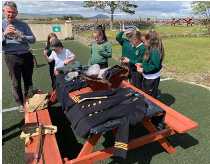
Pupils from Scoil na Maighdine Muire gan Smál Co. Galway received a visit from a local historian who showed them some impressive World War II memorabilia.

The broad scope of the Blue Star Programme meant that pupils were able to focus on a historical theme appropriate to their age and class. In this way, the Programme afforded teachers the necessary flexibility to adapt it to suit their requirements and curriculum. Additionally, due to school closures this year, the availability of Blue Star Programme resources online allowed pupils to continue working on their projects while they were schooling from home. Many teachers mentioned that the availability of these resources online afforded them the opportunity to complete the Programme this year as it was possible for pupils to continue their work at home when it was needed. Finally, pupils completed the 'Historical Element Quiz' which was a new initiative introduced by the Blue Star Programme Team for the 2020-2021 school year.