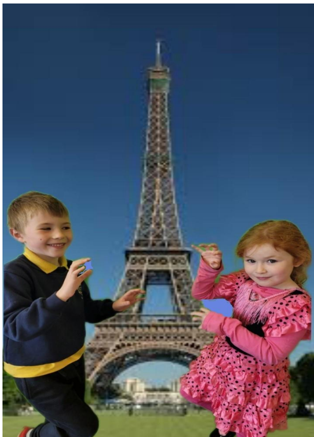
Pupils at St. Patrick's N.S., Co. Wicklow enjoying the cultural element of the Programme