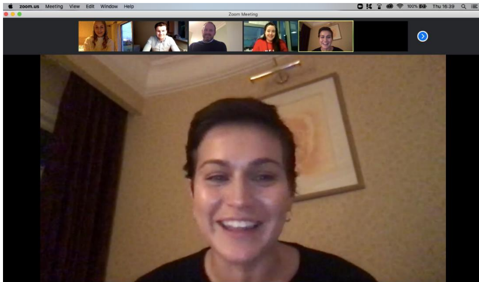
Maria Walsh MEP addressing teachers during the teacher training workshop on 26 November 2020.

Members of the Blue Star Programme Team gave a presentation to participating teachers during the teacher training workshops in November and January.