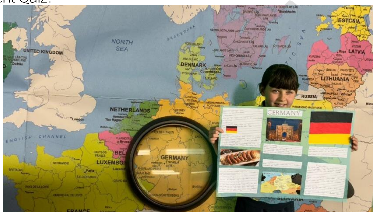
Pupil from Cloughfin N.S., Co. Donegal with her Geography project on Germany.

For this module, some schools also used interactive maps and technology to learn about the capital cities of European countries; we were pleased to see this continued integration of technological teaching resources to aid pupils' learning. Additionally, pupils completed the 'Geography Element Quiz'.