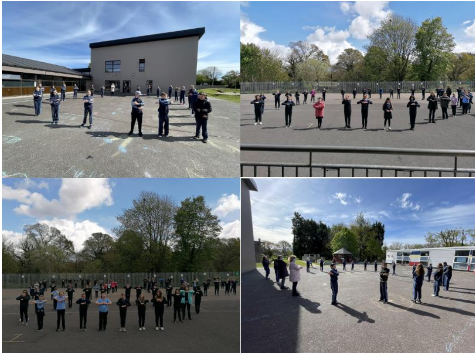
Pupils from various primary schools across Ireland taking part in the 'Air Handshake' in their school yards in solidarity and unity with each other.