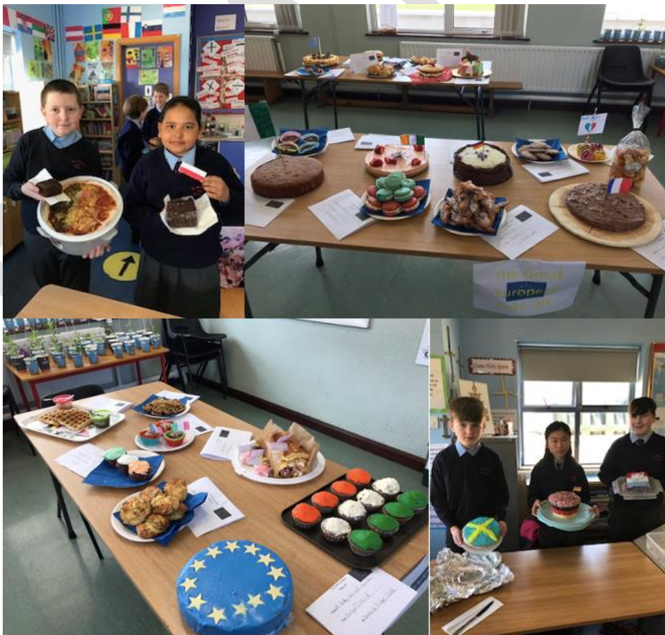
The Great European Bake-Off!