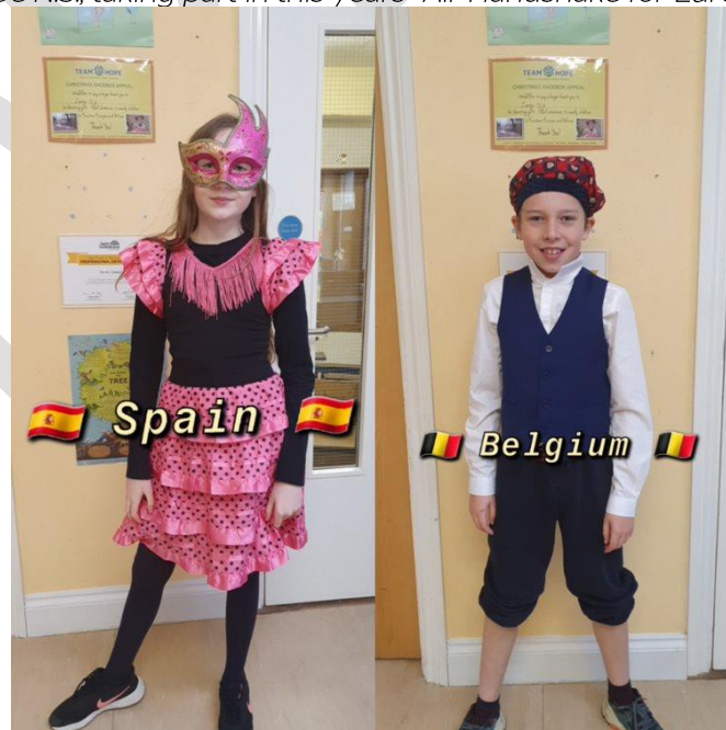
Pupils at Lurga N.S., dressing up in traditional clothes from stated countries as part of their Europe Week celebrations.