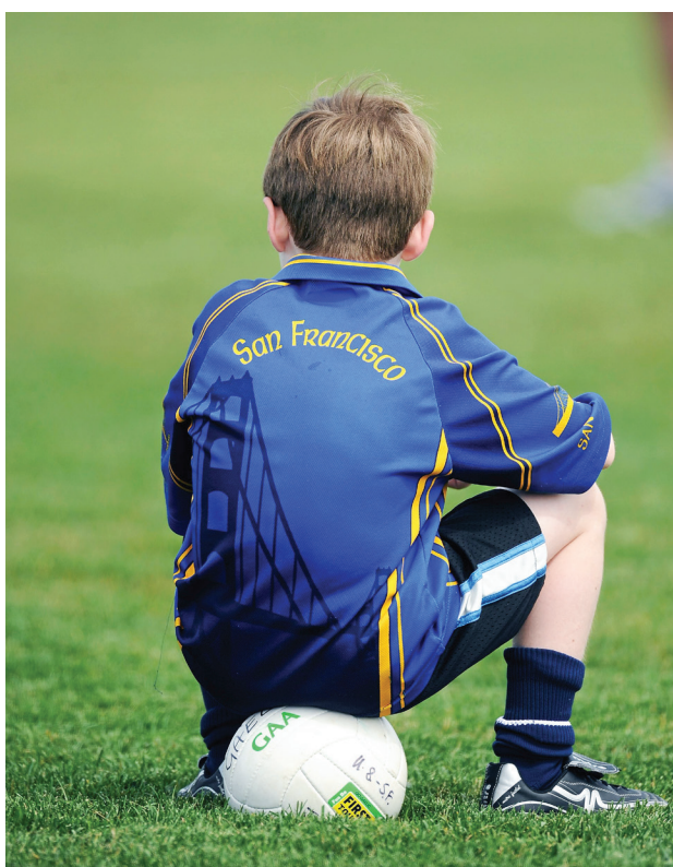
Gaelic Football in San Francisco

We will showcase modern Ireland in major venues.