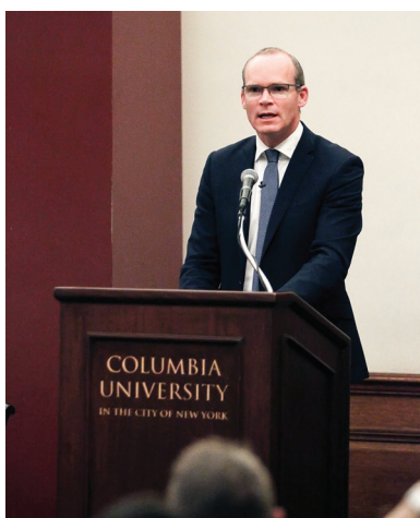
Tánaiste Simon Coveney speaking at a Brexit themed event in Columbia University, New York, February 2018

We will support and defend the mutual benefits of open and ambitious economic relationships that already support 270,000+ jobs in Ireland, the US and Canada.