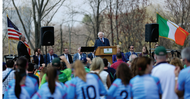
President Michael D. Higgins addresses a crowd at the Rockland GAA Club in New York, April 2018