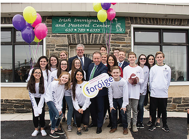
Minister of State Ciaran Cannon launching the first international Foróige club in Philadelphia, February 2018

We will strengthen our Team Ireland approach.