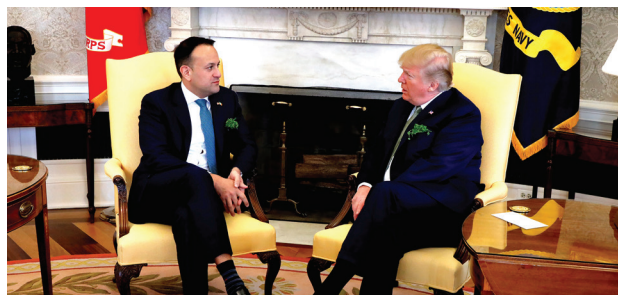
An Taoiseach Leo Varadkar meeting with President Donald Trump in the White House, March 2018

We will double the impact of high-level visits by Government, with a programme of 30-40 visits annually, targeting more of these visits at new sectoral and regional opportunities.