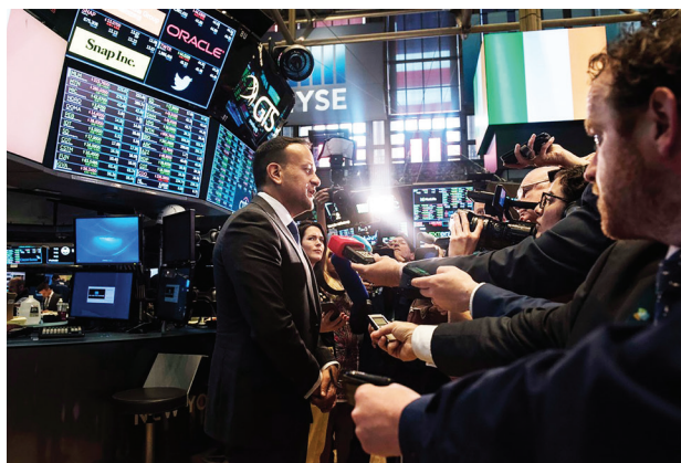
Taoiseach visiting the New York Stock Exchange, July 2018