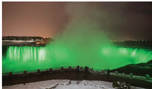
Niagra Falls in green