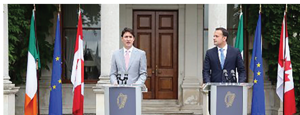
An Taoiseach Leo Varadkar and Prime Minister Justin Trudeau in Dublin, July 2017