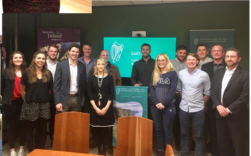
Above: The Consulate hosted some of Austin's Irish J1 students with Irish Network Austin.