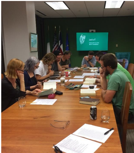
James Joyce Society of Austin studying Finnegan's Wake at the Consulate