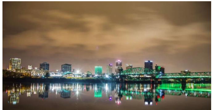
Little Rock, AR