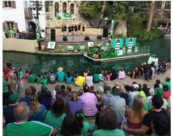
A literal St. Patrick's Day Parade 'float' on the green river in San Antonio, TX