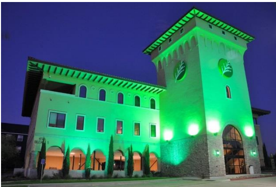
Cedar Park, TX

Many thanks to all who made these greenings happen in 2017, and we look forward to adding even more next year!