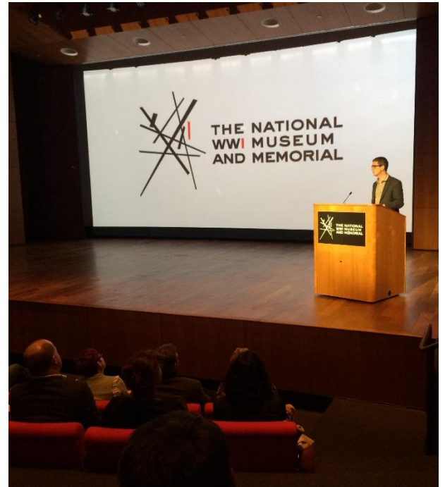
Kansas City American Conference for Irish Studies