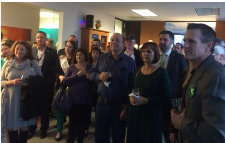
St. Patrick's Day community reception in Austin, TX