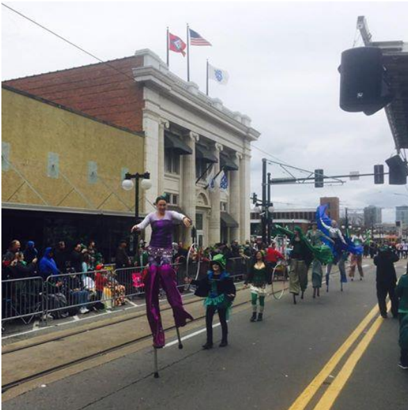
St. Patrick's Day parade in Little Rock, AR