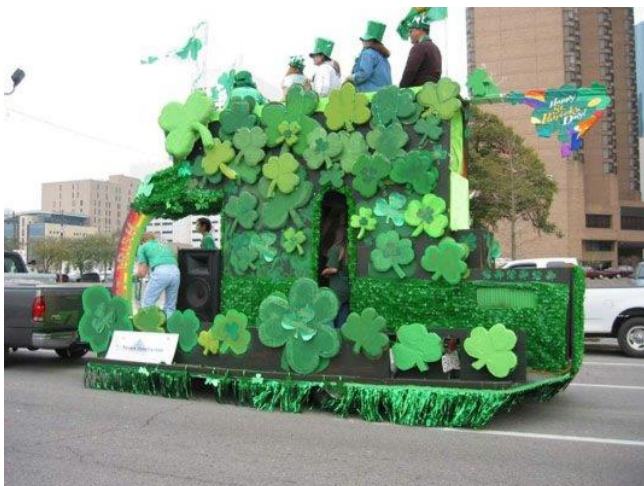
St. Patrick's Day parade in Houston, TX