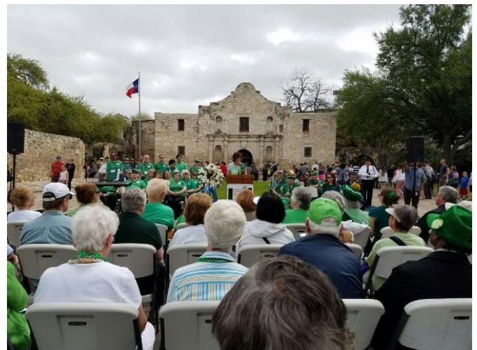
50 th anniversary of the Harp and Shamrock Society's wreath laying ceremony at the Alamo in San Antonio, TX