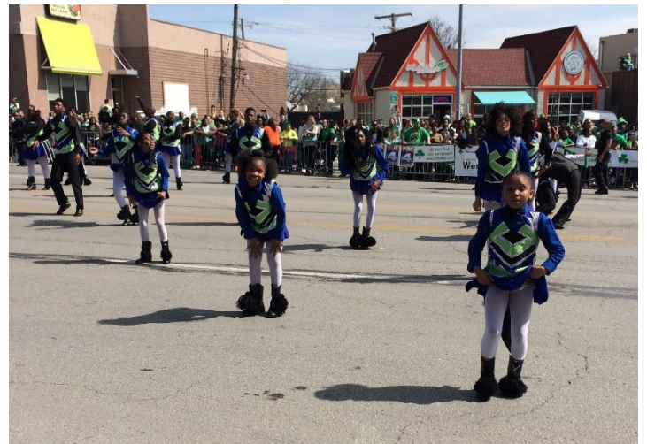
Young performers at the St. Patrick's Day parade in Kansas City