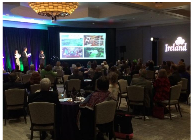
Tourism Ireland event in Austin, TX