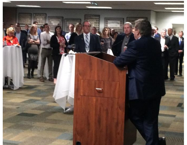
Minister Pat Breen speaks to attendees at a St. Patrick's Day reception at St. Thomas University in Houston, TX