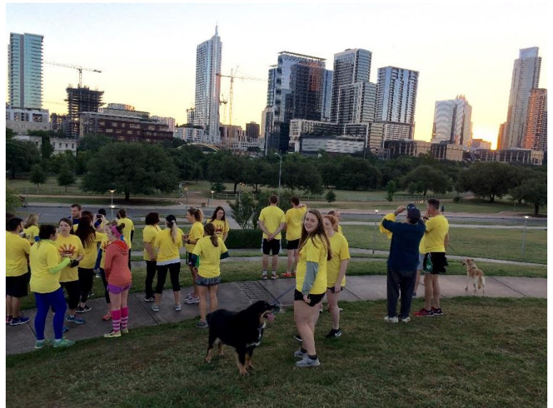
"Darkness Into Light" event in Austin, TX to raise awareness and funds to fight suicide