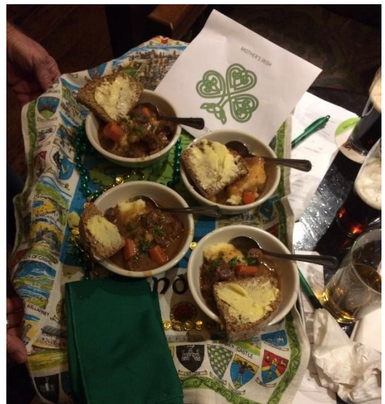
Annual AOH Stew Cook-Off in Austin, TX