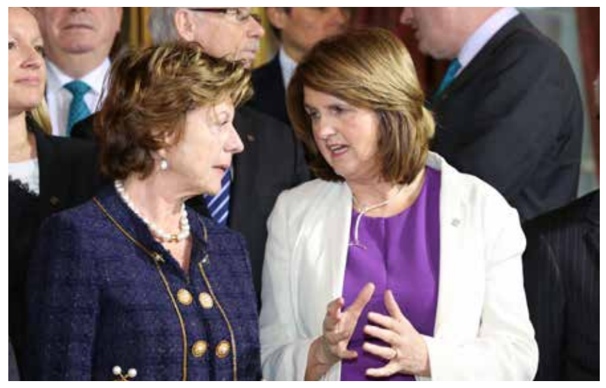
European Commission Vice President Kroes and Minister Burton