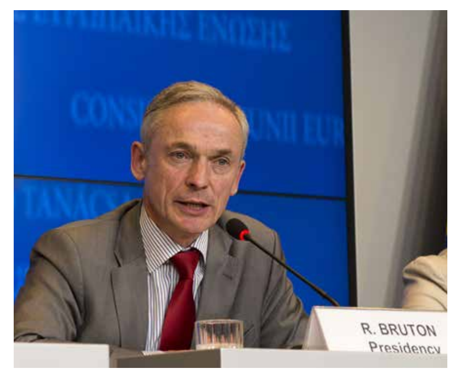
Minister Bruton at the Trade Council in Brussels

The Presidency reached agreement with the European Parliament on the Union Customs Code (UCC), which simplifies and modernises customs procedures in support of the jobs and growth agenda. The modernisation of customs procedures and the increased use of IT systems will facilitate more efficient clearance procedures and reduce costs for business while ensuring safe and secure trade of goods in the EU. The new agreement will make it easier for exporters to trade and invest internationally and will help reinforce the EU as a competitive global economy.