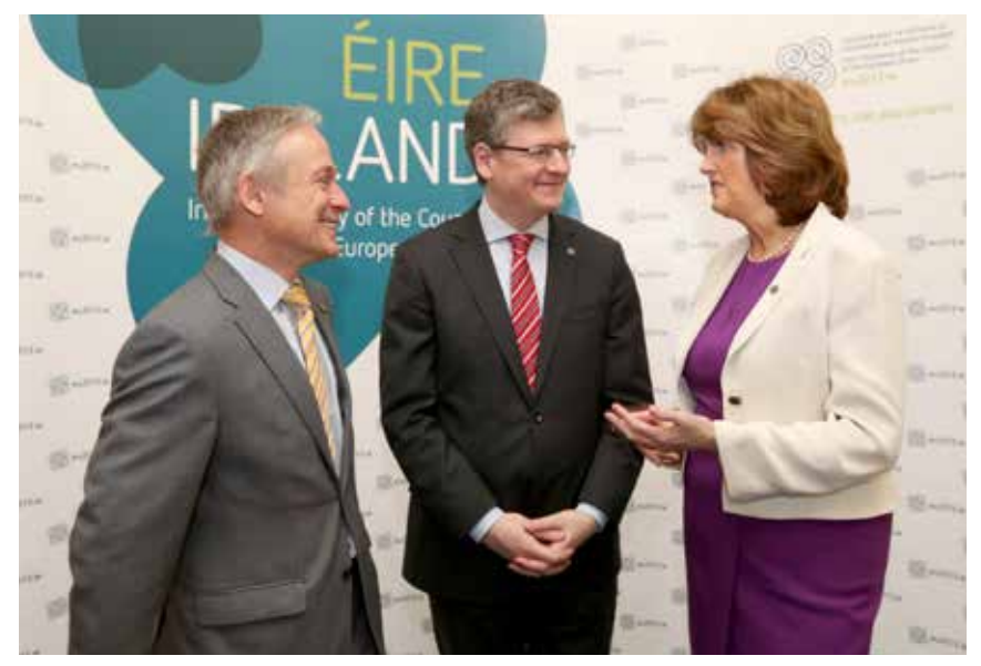
Minister Bruton, Commissioner Andor and Minister Burton

The free movement of workers is a key element of the Single Market and is an important driver of growth. The Presidency secured a General Approach within Council in June on the Directive on improving the Portability of Supplementary Pension Rights. This proposal aims to remove obstacles to ensure that citizens can choose, with confidence, to live and work anywhere in the EU without fear of losing their pension entitlements.