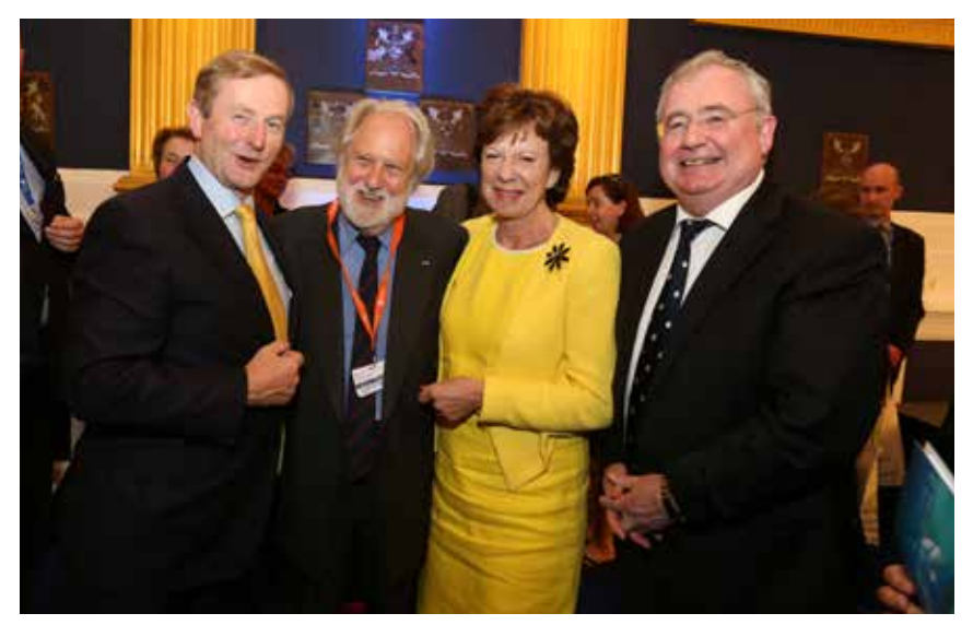
Taoiseach Kenny, Lord Puttnam, European Commission Vice President Kroes and Minister Rabbitte

Better accessibility to online services can allow real social and economic gains for all citizens. User-friendly websites should be made available to all citizens, including those with disabilities. The proposed single set of accessibility rules will also deliver benefits for business, as developers can offer their products and services across the whole EU without extra adaptation costs. The European web accessibility market, estimated at €2 billion, is currently only reaching 10% of its potential, offering significant scope for future growth and job creation. The Presidency has made good progress on this proposal, which is a first step in a process that aims to remove barriers to accessing internet products and services in the Single Market.