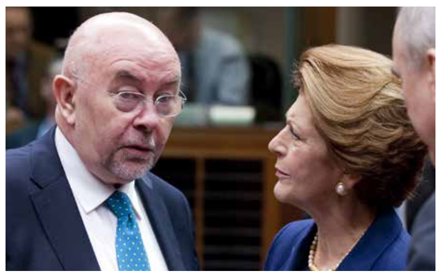
Minister Quinn and Commissioner Vassiliou

only ensure that participants reach their potential but will also contribute to improving the skills of citizens across Europe to find work or to develop their own business and create employment.