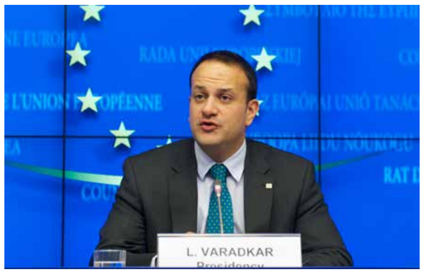
Minister Varadkar at the Transport Council in Brussels

Global navigation satellite systems (GNSS) are now used in all forms of transportation from ships and airplanes to trucks and taxis as well as by millions of individual citizens on their mobile phones or in their motor vehicles. Up to now users of GNSS had to depend on US GPS or Russian Glonass signals. Galileo now offers an alternative which is run by civil and not military authorities. The Irish Presidency secured agreement on the development of Galileo which will see the establishment of a new financial and governance framework for the two European satellite navigation programmes Galileo and the European Geostationary Navigation Overlay System (EGNOS). It will provide an independent, highly accurate and guaranteed global position service under civilian control which will ensure the protection of financial and communication activities as well as commercial, humanitarian and emergency services (and make it much harder for any of the EU's 500 million citizens to get lost!).