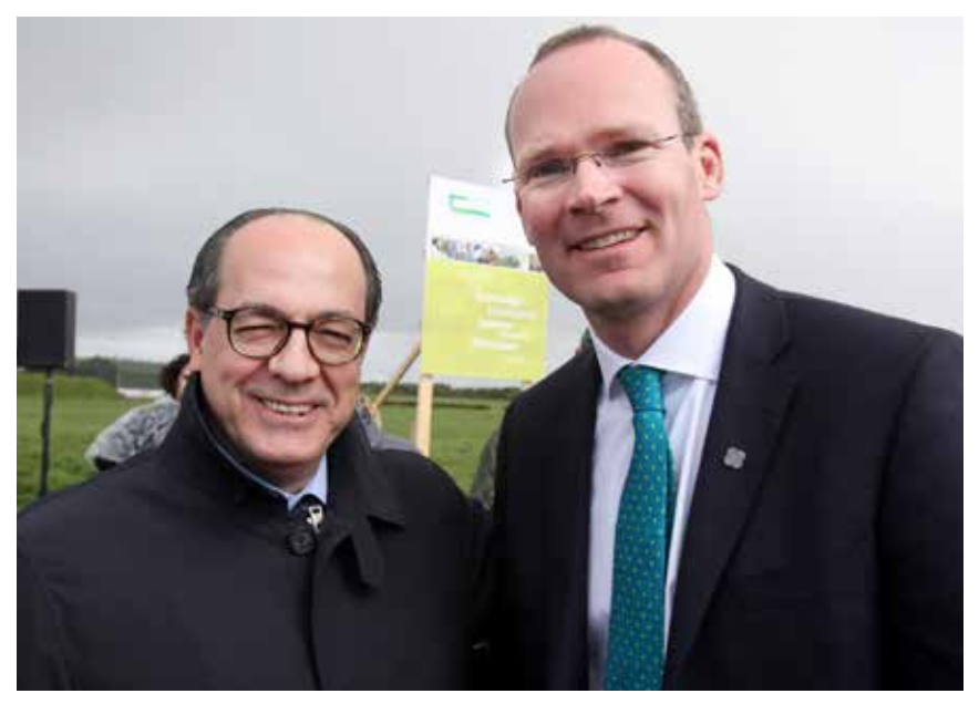
Minister Coveney and Chair of European Parliament Agriculture and Rural Development Committee de Castro