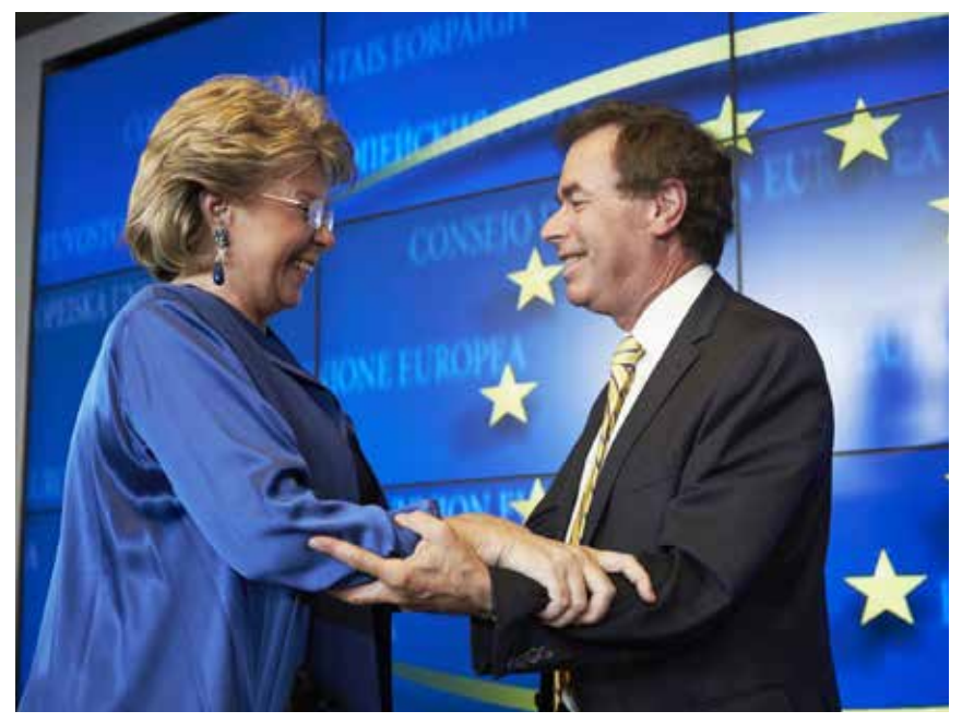
Commission Vice President Reding and Minister Shatter

This proposal lays down rules for disbursement of Union funds in relation to police cooperation, internal security and crisis management matters to contribute to ensuring a high level of security in the EU. The Fund aims to enhance the capacity of Member States and the Union to effectively manage security-related risks and crises, to contribute to crime prevention, to combat cross-border serious and organised crime, and to reinforce coordination and cooperation between law enforcement authorities of Member States. The Presidency resolved outstanding technical issues relating to this dossier.