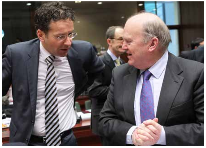
Minister Noonan with Eurogroup Chair Dijsselbloem

Provisional agreement was reached with the European Parliament on the proposed Mortgage Credit Directive in April with final agreement expected shortly. The agreement on the new Mortgage Credit Directive will mean more information and better protection for consumers in relation to mortgages.