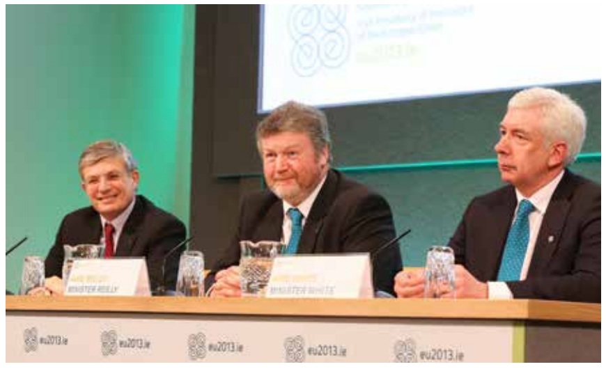
Commissioner Borg, Minister Reilly and Minster of State White at the Health Informal in Dublin

Agreement was secured with the European Parliament on a Decision which will help Member States prepare and protect citizens against possible future pandemics and environmental disasters. It also strengthens risk preparedness and response planning, improves access to vaccines for Member States, and