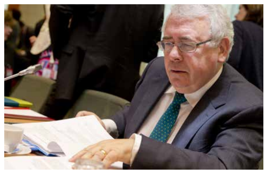
Minister of State for Trade and Development Costello in Brussels

The EU and its Member States collectively provide over half of global development assistance to poor countries: a constant challenge is to ensure that financial assistance is as effective as possible in transforming the lives of people in developing countries. During its Presidency Ireland worked in close cooperation with the High Representative for Foreign Affairs and Security Policy, to advance the fight against poverty and hunger, and to promote peace, respect for human rights and justice in the EU's development policy.