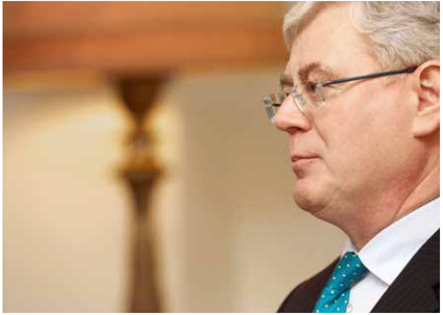
Tánaiste Eamon Gilmore at Informal meeting of Ministers for Foreign Affairs