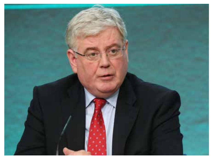
Tánaiste Eamon Gilmore