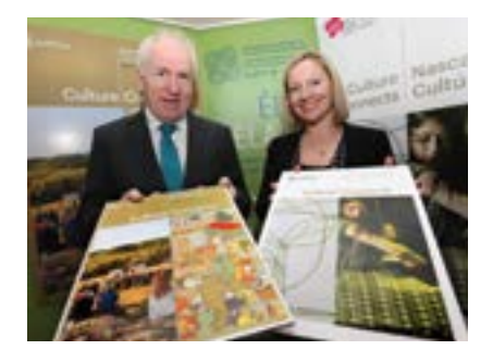
Presidency cultural events in Ireland and across Europe