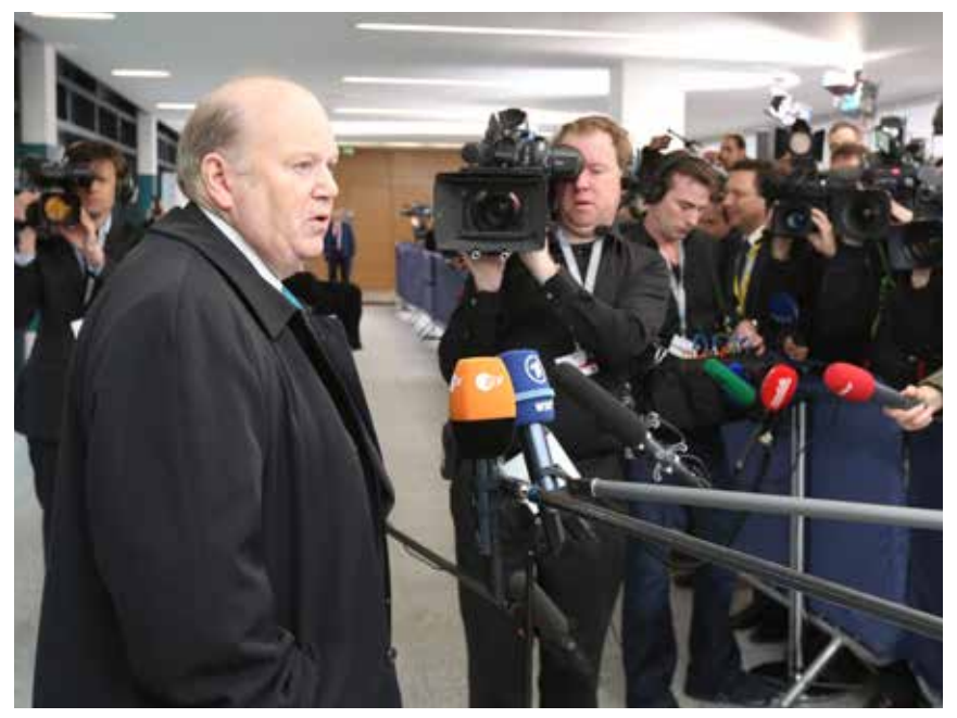
Minister Noonan at Informal meeting of finance ministers, Dublin

The proposed Financial Transaction Tax (FTT) will be applied on certain transactions between financial institutions. At the first meeting of Finance Ministers chaired by the Irish Presidency in January, agreement was secured by the Presidency to proceed with discussions on FTT using the enhanced cooperation procedure.