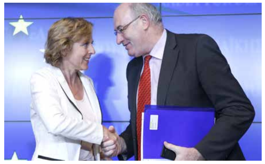
Commissioner Hedegaard and Minister Hogan at the Environment Council in Brussels

substances classified as priority hazardous substances. In April the Presidency reached agreement with the European Parliament on the proposals to monitor and control additional substances, with the aim of making Europe's water safer and cleaner.