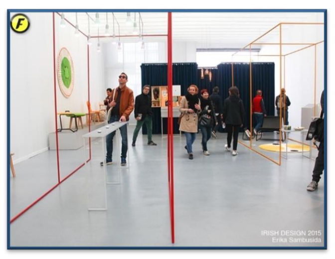
Liminal – Irish Design at the Threshold, Milan.