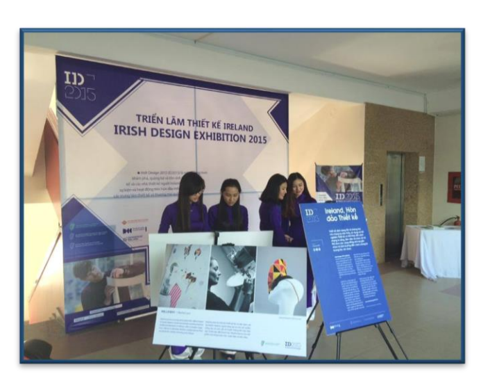
Irish Design Exhibition, Hanoi

Irish Design 2015 exhibitions were organised in Hanoi from 23 – 27 November in partnership with University of Science/Vietnam National University Hanoi; in Danang from 23 – 27 November in partnership with Danang Architecture University and Action for the City Development; in Ho Chi Minh city from 30 November to 4 December in partnership with International University/Vietnam National University HCMC; and in the ancient city of Hoi An from 17 – 20 January 2016 in partnership with Phan Chu Trinh University and Action for the City Development.