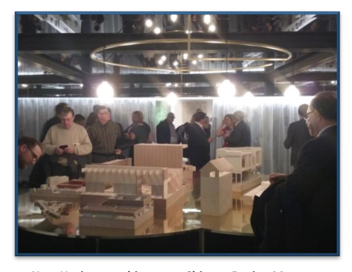
New Horizon_architecture, Chicago Design Museum.

The Consulate General in Chicago hosted Society and Progress capsule exhibition to coincide with the launch of New Horizon architecture from Ireland at Chicago Design Museum partnership with the Chicago Architecture Biennial (running from 3 October 2015 to 31 January 2016). The exhibition features the work of emerging Irish practices. Enterprise Ireland also partnered with the Consulate and ID2015 to deliver a Design Feasibility Study, which was led by the Minister for Business and Employment, Ged Nash TD. The purpose was to raise the profile of the quality and expertise that