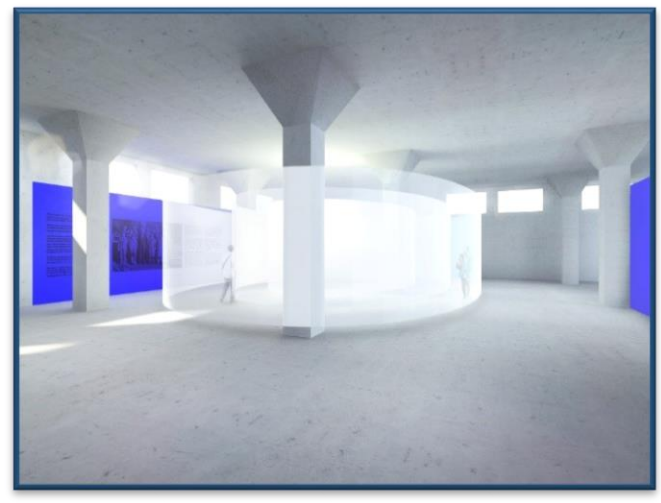
The Ireland Pavilion installation

Over 1,000 invitees attended the opening, including the Mayor of Shenzhen and other regional leaders. The event and