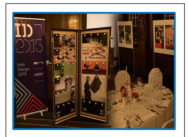
Embassy ID2015 exhibition at INBA event