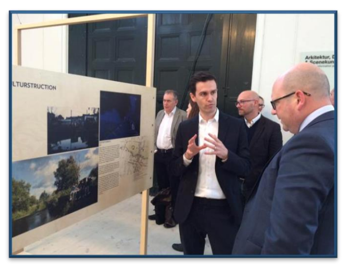
New Architecture: Ireland, Copenhagen.

The Embassy in Copenhagen partnered with ID2015 to support the presentation of New Architecture: Ireland at the Royal Danish Academy of Fine Arts, officially opened by the Minister for Business and Employment, Ged Nash TD. The keynote speech by the Minister was followed by a panel discussion featuring young architects practicing in Ireland and Denmark, allowing for consideration of lessons each country could learn from the other. Minister Nash's visit was part of a broader Design Feasibility Study to Scandinavia and The Netherlands.