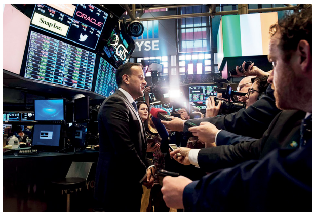
Taoiseach visiting the New York Stock Exchange, July 2018