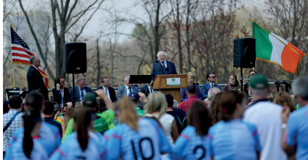
President Michael D. Higgins addresses a crowd at the Rockland GAA Club in New York, April 2018