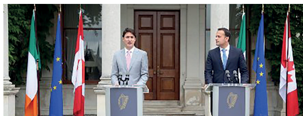
An Taoiseach Leo Varadkar and Prime Minister Justin Trudeau in Dublin, July 2017