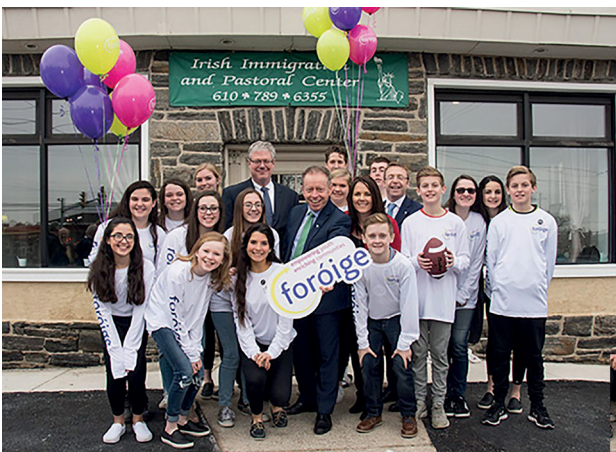
Minister of State Ciaran Cannon launching the first international Foróige club in Philadelphia, February 2018

We will strengthen our Team Ireland approach.