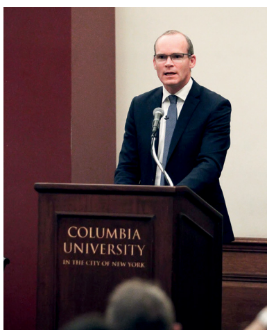
Tánaiste Simon Coveney speaking at a Brexit themed event in Columbia University, New York, February 2018

We will support and defend the mutual benefits of open and ambitious economic relationships that already support 270,000+ jobs in Ireland, the US and Canada.