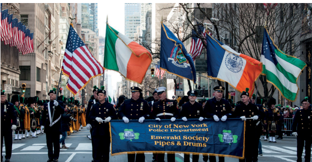
New York Police Department officers and Pipe & Drum Band in the New York City St. Patrick's Day Parade, March 2018