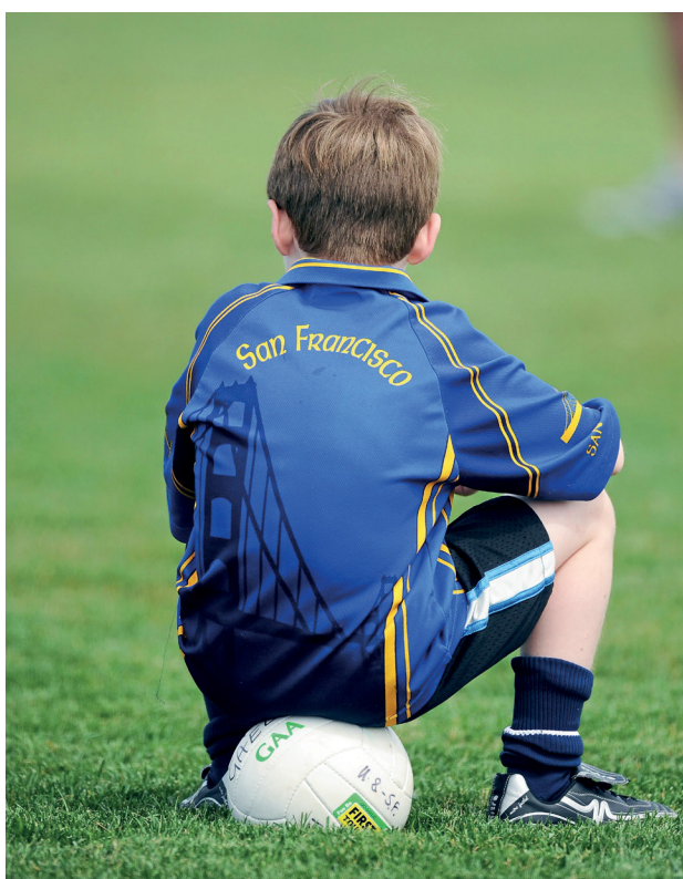
Gaelic Football in San Francisco

We will showcase modern Ireland in major venues.