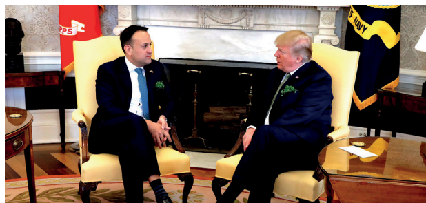
An Taoiseach Leo Varadkar meeting with President Donald Trump in the White House, March 2018

We will double the impact of high-level visits by Government, with a programme of 30-40 visits annually, targeting more of these visits at new sectoral and regional opportunities.