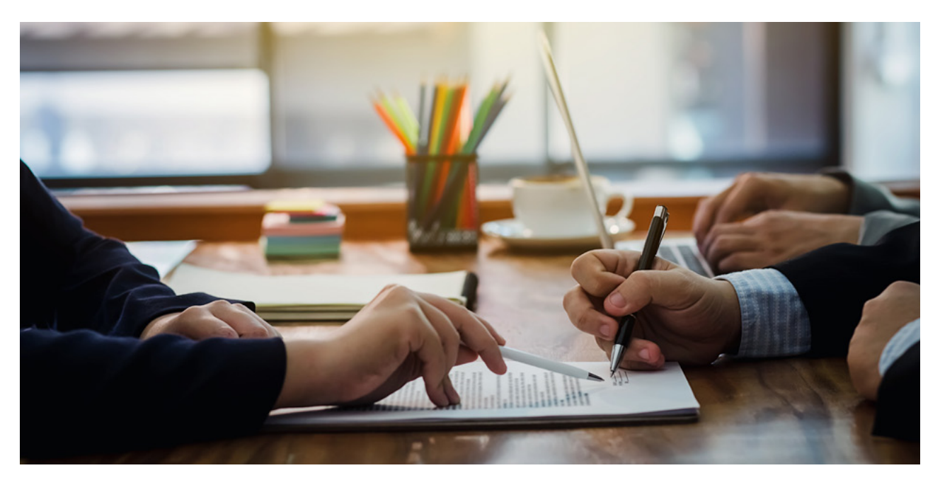
EU Officials work in a wide variety of roles in the EU's Institutions, Agencies and bodies based in all 27 EU Member States

The range of workplaces is also extremely wide. While a little over half of the EU's total staff are employed at the European Commission, other Institutions - such as the European Parliament, the Council of the European Union and the Court of Justice of the European Union - also recruit staff regularly. So do the EU Agencies, based across the 27 Member States, including Eurofound which is based in Loughlinstown, Co Dublin.