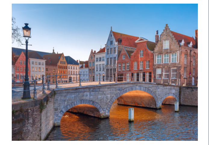
The College of Europe is a post-graduate institution which specialises in EU affairs. Classes are taught through French and English in its two campuses in Bruges, Belgium (pictured) and Natolin, Poland