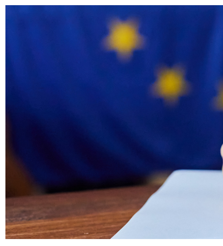
EU Jobs candidates secure roles by applying through open competitions, commonly referred to as "concours"

The EU Institutions do not usually recruit to fill individual posts. Instead, they hold regular competitions (called 'concours') to identify panels of qualified candidates, who can then be recruited by the Institutions as the need arises. The European Personnel Selection Office (EPSO) is the EU's recruitment service which manages this process.