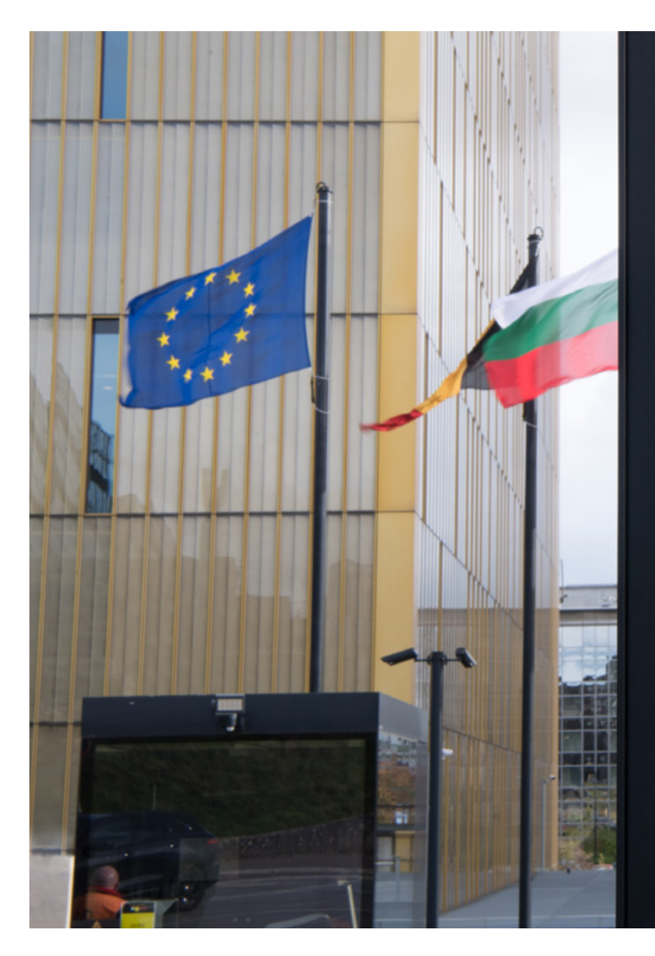
All EU Institutions and Agencies run traineeship programmes for recent graduates, including the Court of Justice of the EU based in Luxembourg

Many EU careers begin through the Institutions' traineeship programmes. All of the EU Institutions and Agencies offer "stages" to university graduates. Most are for periods of five to six months and they are paid in almost all cases.