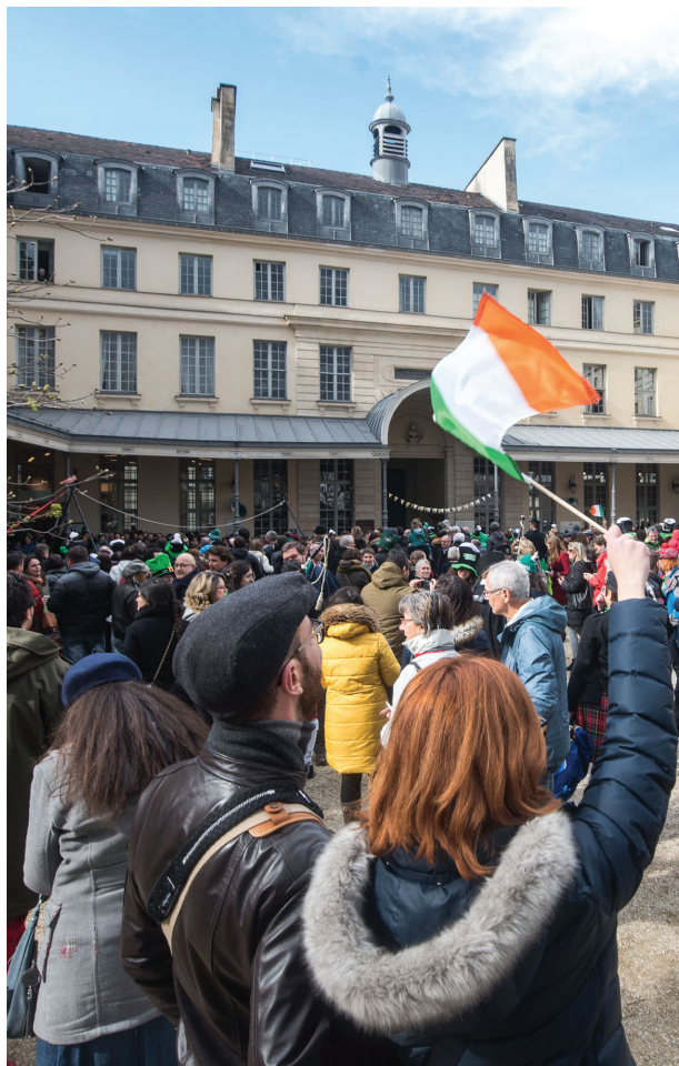
St Patrick's Day at the Centre Culturel Irlandais, 2019