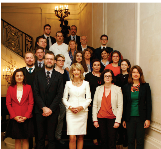
Team at the Embassy of Ireland, Paris