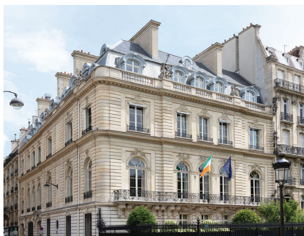
The Embassy of Ireland, Paris