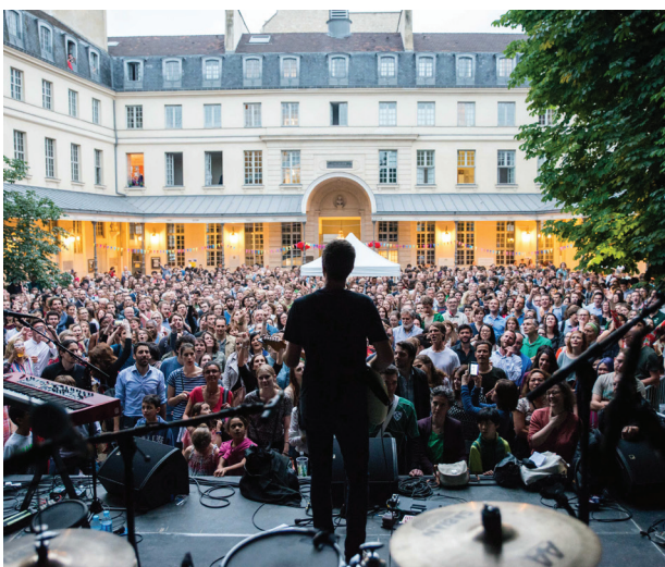
Fête de la musique at the Centre Culturel Irlandais