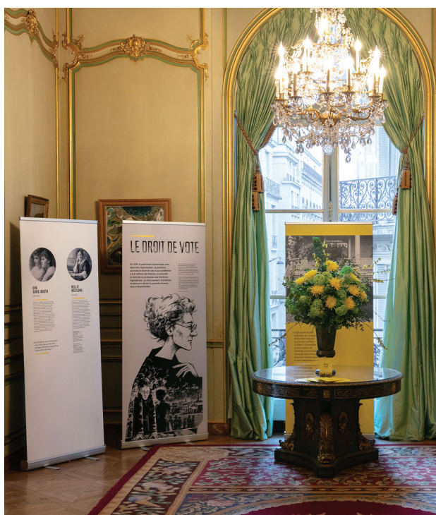
Blazing A Trail exhibition, Embassy of Ireland, Paris 7th March 2019

The Embassy in Paris already has strong and growing links with France's regions and cities as well as a network of Honorary Consuls in Lyon, Cannes and Cherbourg. But recent reforms have given greater powers to the French regions and feedback from the Irish community indicates a strong desire for greater regional engagement.