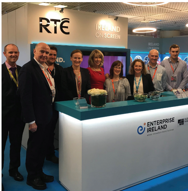
Promoting Ireland's creative industry at the MIPCOM Television Trade Fair, Cannes, 16th October 2018