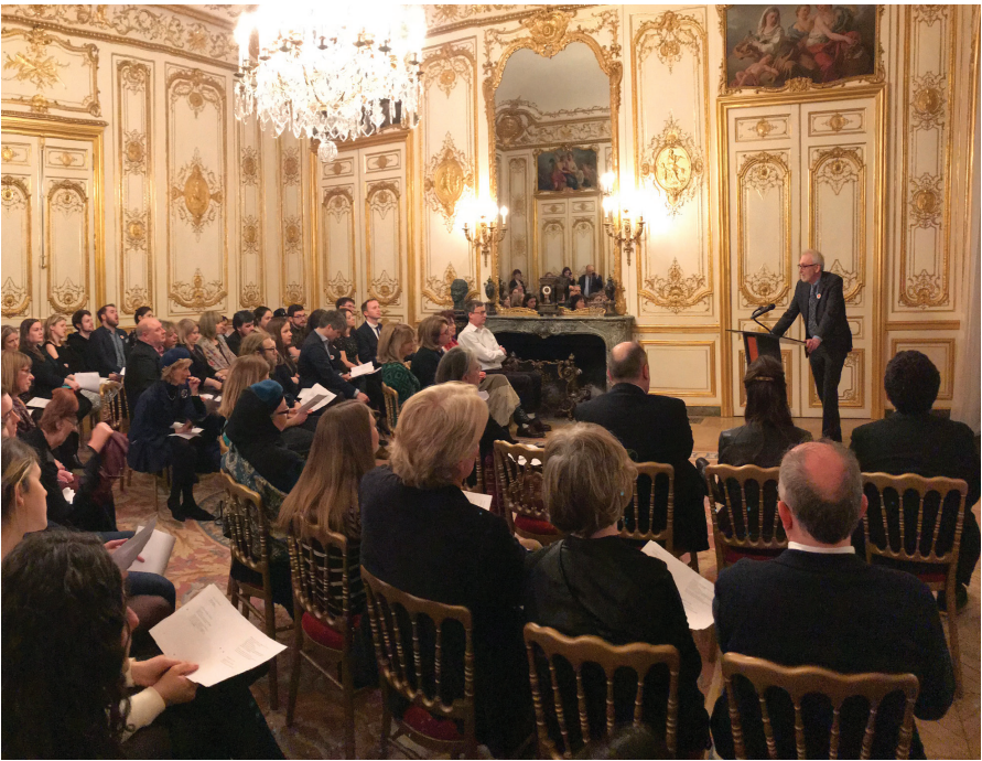
Seachtain na Gaeilge event at the Embassy of Ireland, Paris, 1st March 2018

We will expand our Honorary Consul network.