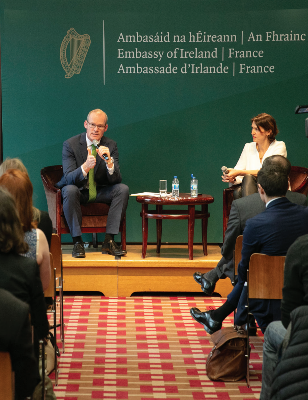
The Tánaiste Simon Coveney speaking on 'Brexit, Ireland and Europe at 27', in Paris on 15 March 2019