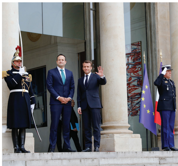
The Taoiseach Leo Varadkar meeting President Emmanuel Macron in Paris, April 2019