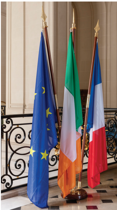
EU, Irish and French flags at the Embassy of Ireland, Paris

As we mark the 50 th anniversary of President de Gaulle's visit and Ireland strives to double its global impact, it is timely to look again at our relationship with France and to explore what more we can do together in spirit and in action.