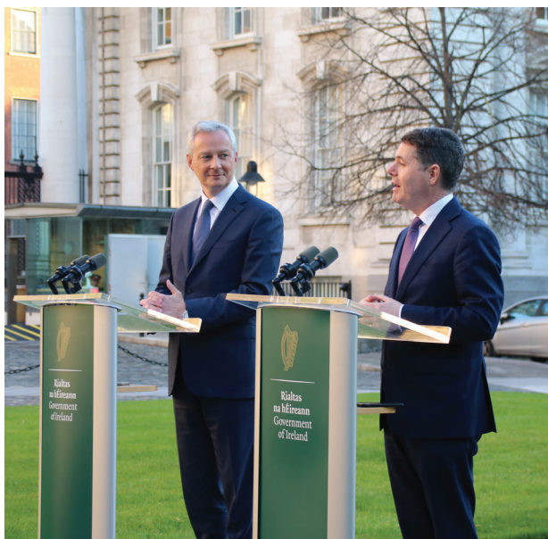
The Minister for Finance Paschal Donohoe and his French counterpart, Bruno Le Maire, in Dublin, February 2019