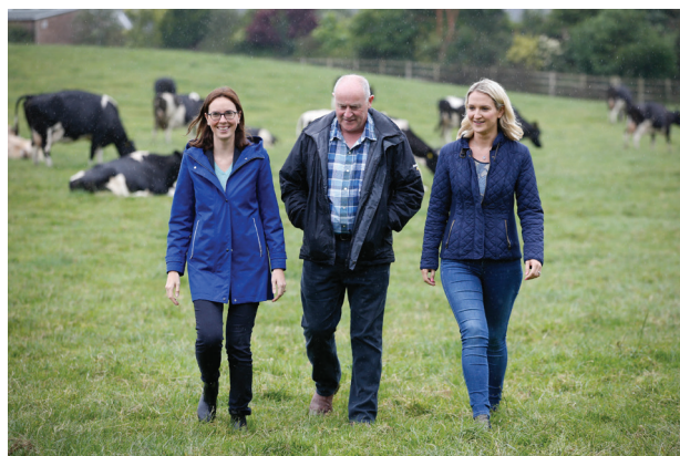
Minister of State for European Affairs Helen McEntee and her French counterpart, Amélie de Montchalin, visit a family farm in Ireland, July 2019

A two-way trade relationship worth €25 billion.