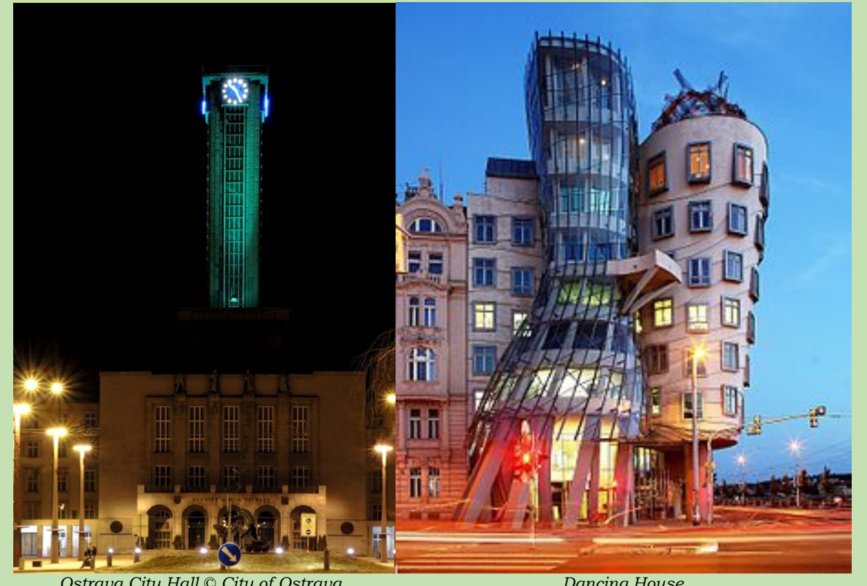
Ostrava Citu Hall