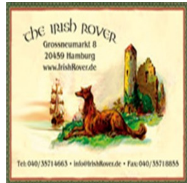
Irish Rover Pub

Starting: 6th February 2017 at 18.30 (15 lessons)