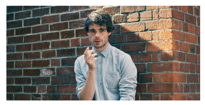
Picture left: HISTORY'S FUTURE, Picture right: STUTTERER

Part fiction, part documentary, part speculative essay on the contemporary world, HISTORY'S FUTURE is about one man's odyssey through a Europe in turmoil – and through his own mind. Losing his memory after a mugging, a man known only as 'MP' (Missing Person) leaves his home and sets out on a journey – in search not only for his memory but perhaps also for a new identity. On his travels from country to country, MP attempts to gain insight into the complexity of life in the 21st-century West – into what commentators have called an age of 'rolling catastrophe'. In STUTTERER an online relationship has helped a lonely typographer mask his cruel speech impediment. Now he is faced with the daunting prospect of finally bringing that relationship into the real world.