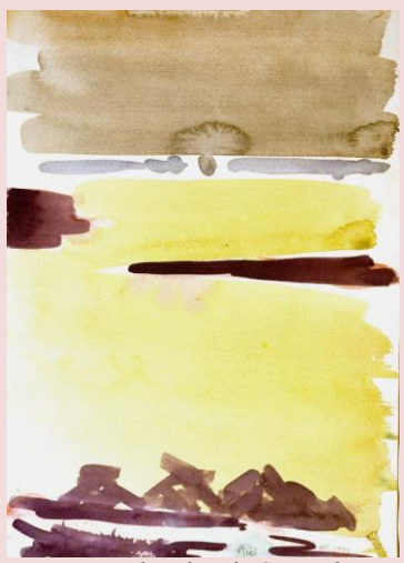
Piles of Turf - Copyright: Noël O'Callaghan

This exhibition features paintings made in the West of Ireland by artists, father and daughter, Diarmuid Ó Ceallacháin (1915 – 1993) and Noël O'Callaghan. The works in the show are in oil and watercolour and span a period of 80 years (1935 - 2015) and chart the changing and unchanging aspects of this part of the world.