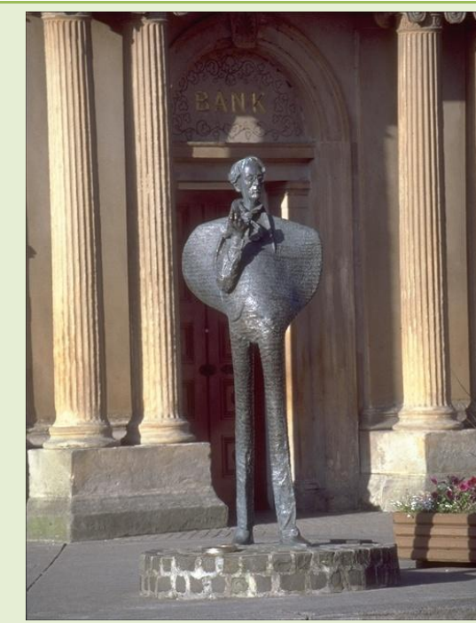
All rights reserved

The 6<sup>th</sup> iYeats Poetry Competition, organised by the Hawk's Well Theatre in Sligo, is accepting applications until Wednesday, 9 July 2014.