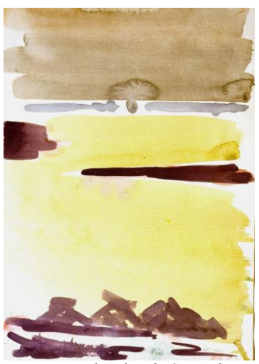
Piles of Turf

The Embassy will host a reception on Thursday, 26 February to launch "Súil Síar –Two Generations paint the West of Ireland".