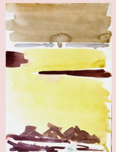
Piles of Turf - Copyright: Noël O'Callaghan

This exhibition features paintings made in the West of Ireland by artists, father and daughter, Diarmuid Ó Ceallacháin (1915 – 1993) and Noël O'Callaghan. The works in the show are in oil and watercolour and span a period of 80 years (1935 - 2015) and chart the changing and unchanging aspects of this part of the world.