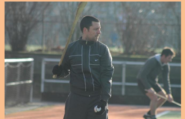
Are you interested in Gaelic sports, music or

just a weekly social event? Every Sunday 'Setanta Berlin' run training sessions for Hurling and Gaelic Football, suitable for all ages and abilities. The circuit training every Thursday is for those hoping to improve their fitness or simply hit personal training goals. To top it all the roaring success of the 'Setanta Monthly Irish traditional Music Night' in Finnegan's Irish Pub allows the session musicians among you to cut loose and show the locals a good time! For further information, and to see the wonderful collection of photos from events, please contact 'Setanta Berlin' via one of the following options: