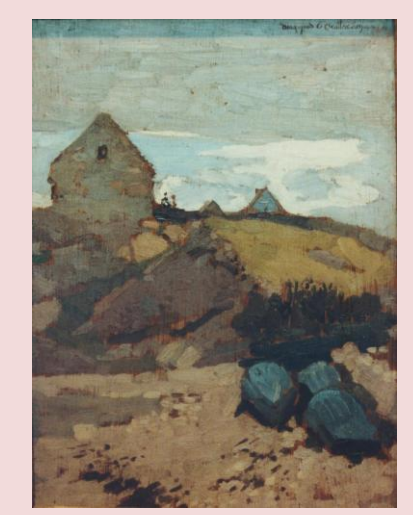
Dawn Light - Copyright: Diarmuid Ó Ceallacháin

Friends of Ireland all over Germany are encouraged to "go green" this St Patrick's Day in as many, creative ways as possible. For inspiration in how you can get involved in this global initiative, please visit <u>http://youtu.be/02bosK7TIho</u>.