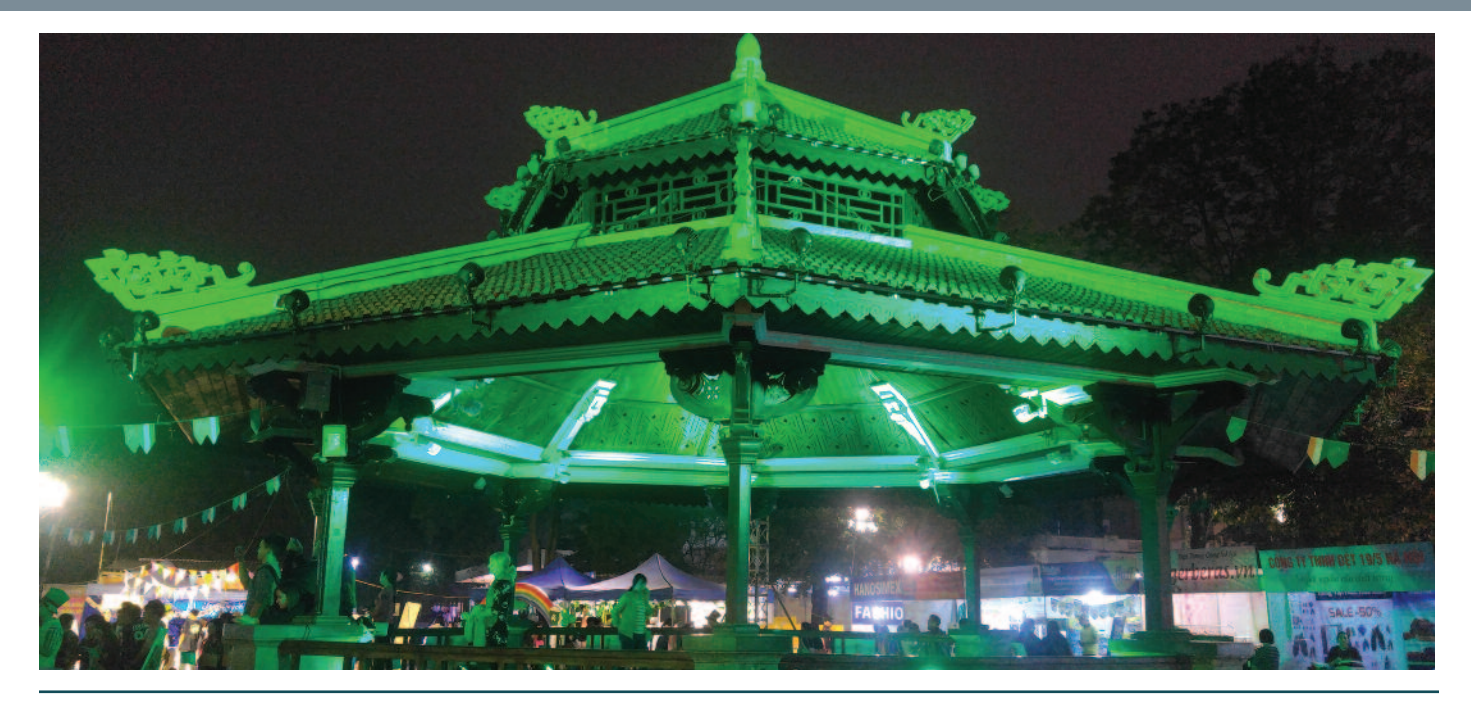
Hanoi became the first city in South East Asia to join Ireland's Global Greening Campaign 2017 and Ly Thai To Park has become the 100th landmark in the world to go green for St. Patrick's Day, together with iconic landmarks in 35 countries

In a region with a vibrant cultural life, Irish culture, arts and sport can be leveraged to great effect to increase the visibility of Ireland and build bilateral relationships. There are active Gaelic Athletic Association (GAA) clubs in Hanoi and Ho Chi Minh City. The Ireland Vietnam Alumni Network now has nearly 200 members with networks in Hanoi and Ho Chi Minh City and a 'friends of Ireland' group on social media networks is growing quickly.