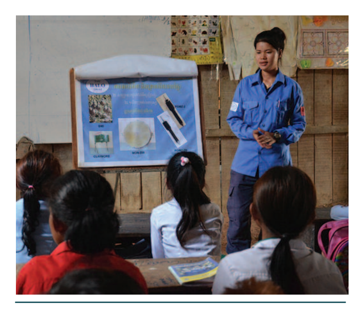
Irish Aid supports humanitarian mine action and the clearance of unexploded ordnance in Vietnam, Cambodia and Lao PDR. This is a HALO Trust Clearance and Mine Risk Education session in Cambodia.

Irish State Agencies including Enterprise Ireland, IDA Ireland and An Bord Bia are present in the Asia region (with staff co-located in Ireland's Embassy in Singapore). Ireland's new trade and investment strategy Ireland Connected: Trading and Investing in a Dynamic World (2017) emphasises the importance of the continued diversification of our export markets and will guide our efforts to harness opportunities for Irish trade and investment.