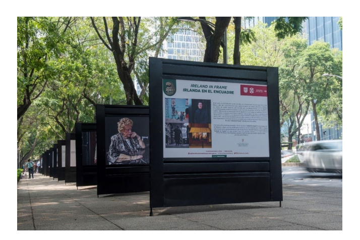
Ireland in Frame street photography exhibition, Mexico City, 2021.

Ireland will deliver a step-change in our political partnerships with the countries of Latin America and the Caribbean.