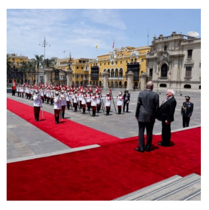
President Michael D. Higgins visits the Presidential Palace in Lima, 2017.

Latin America and the Caribbean has a population of more than 650 million with a significant and growing middle class. The COVID pandemic has hit the region harder than most, but it remains a dynamic, creative global player, with huge differences within and between its many countries, peoples and cultures. The potential for mutual benefit from enhanced two-way engagement – both bilaterally and through the EU – across a whole range of sectors is very significant. The Strategy will make an important contribution to our collective efforts to recover from the severe human and economic costs of the pandemic.