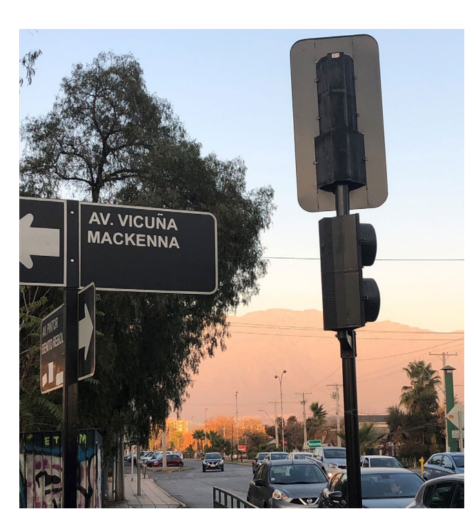
Avenue MacKenna, named after Chilean writer Vicuña MacKenna, grandson of Irish-born Chilean independence hero Juan MacKenna, Santiago, Chile, 2021.