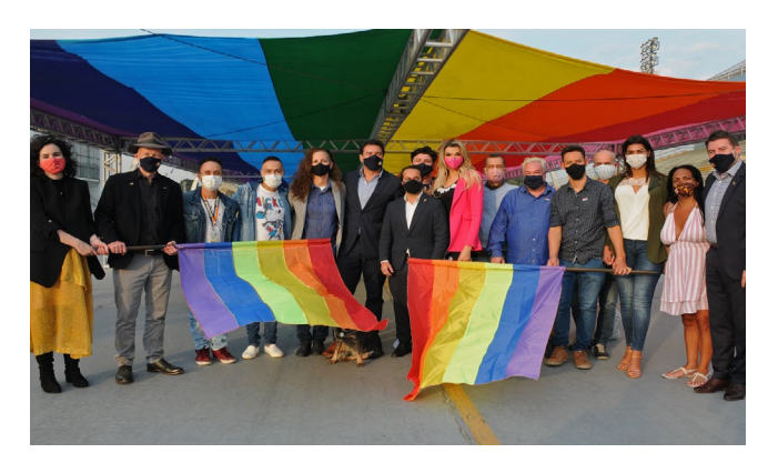
Staff of Embassy Brasilia and Consulate General Sao Paulo celebrate Pride with local activists, Brazil, 2021.