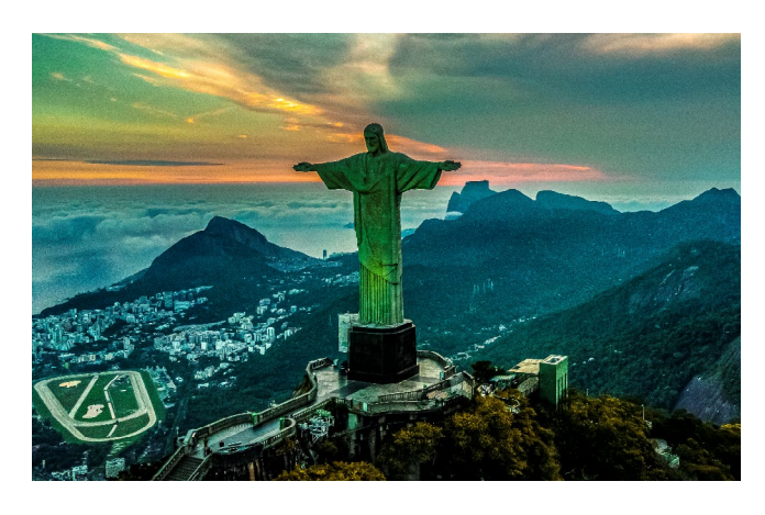
Christ the Redeemer statue lights up in green for St Patrick's Day, Rio de Janeiro, 2021.