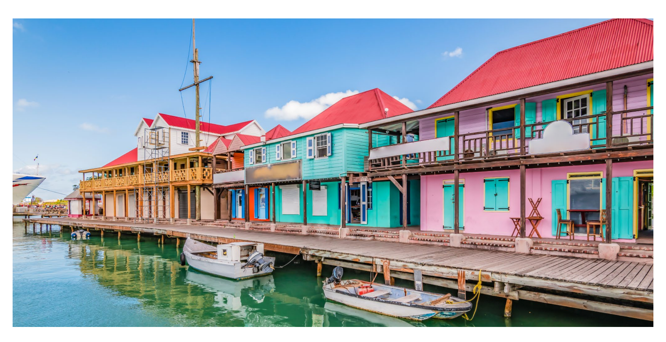
St. John's, capital of Antigua and Barbuda. Enhanced engagement with the Caribbean states is a key element of the Strategy.