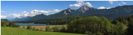
Faaker See, Carinthia.