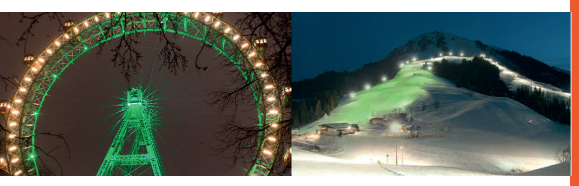
Riesenrad goes Green

New York and the tallest building in the Western Hemisphere – will join Tourism Ireland's Global Greening initiative for the first time. It will be joined in this the eight year of the Global Greening by some old favourites like the Colosseum in Rome, the Sacré Coeur basilica in Paris, the Great Wall of China, Niagara Falls and the Christ the Redeemer statue in Rio de Janeiro and of course the Riesenrad in Vienna, which will turn green on the 7th of March.