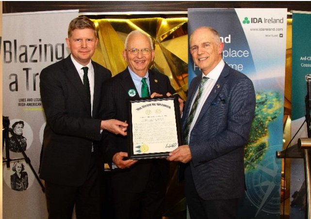
Agriculture Commissioner Gary Black presented a framed "Declaration of Mutual Cooperation between the State of Georgia and Ireland" to Minister Stanton.