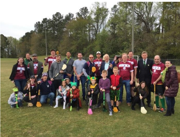
Right: Minister Stanton's met with participants in Irish Network Atlanta's new mentorship programme.