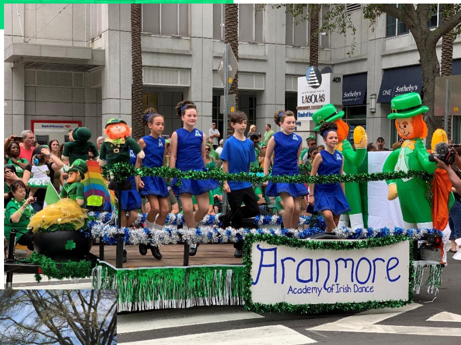
Below: Irish dancers participate in Fort Lauderdale St. Patrick's Day Parade