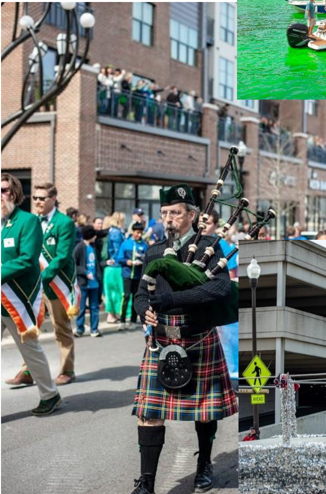
Left and Below: Huntsville, Alabama St. Patrick's Day Parade included Irish dancers and a flute band.