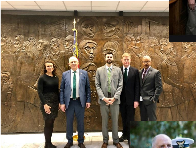
Top: Minister Stanton met with the City of Atlanta