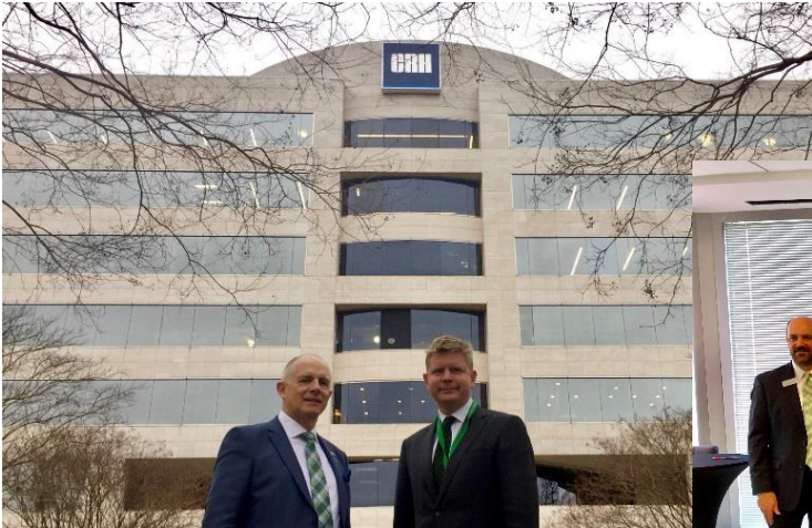
Left: The Minister visited CRH Americas HQ in Atlanta, GA. This Irish firm employs 45,000 people in North America.