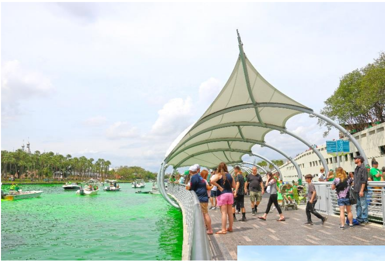
Pictured left and below: The Hillsborough River in Tampa turned green for the Annual 2019 Mayor's River O'Green Fest