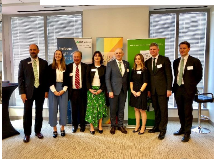
Right: Minister Stanton delivered keynote remarks at a seminar on "Why U.S. Companies should Choose Ireland for Their European Headquarters" which was hosted by IDA Ireland and partners law firms Miller & Martin, from Atlanta, and Mason, Hayes & Curran, from Dublin.