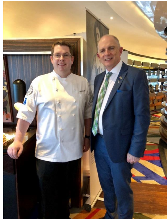
Left: The Minister started St Patrick's Day itself with the Gaelic Athletic Club of Augusta