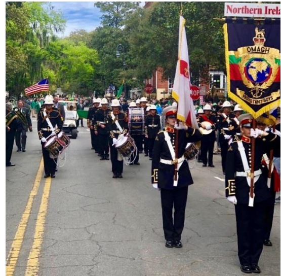
Right: Omagh Protestant Boys Melody Flute Band travelled from Northern Ireland with the support of the Consulate, Ulster Scots Agency and Northern Ireland Bureau in order to participate in this year's Savannah parade