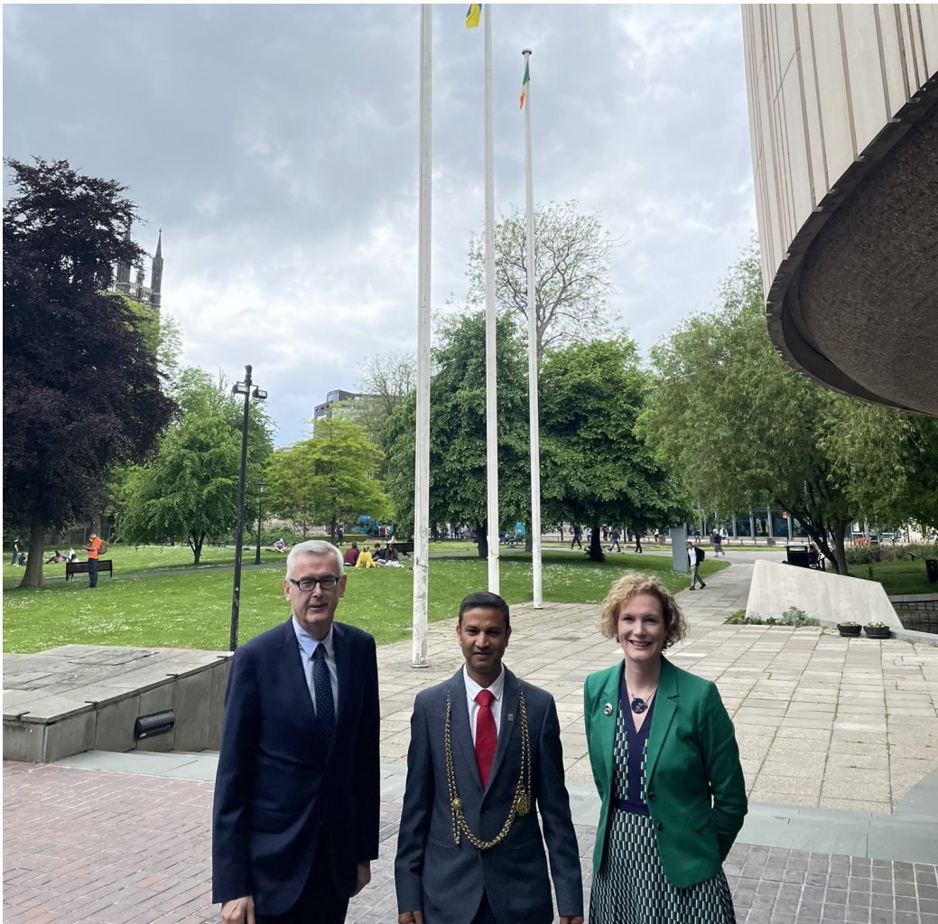
A meeting with Metro Mayor Jamie Driscoll included a stimulating discussion on the achievements of the North Tyne Combined Authority with strong plans for the future.