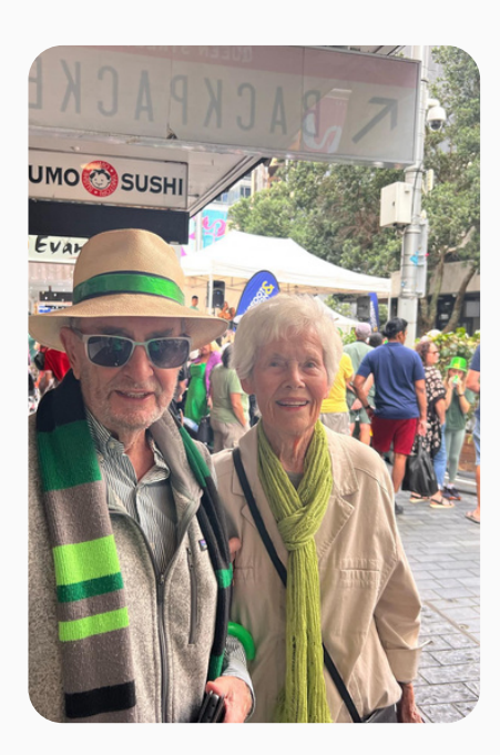
Auckland St Patrick's Day Festival