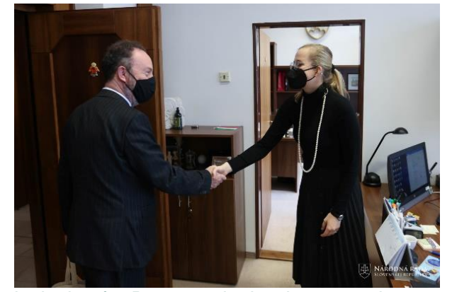
inclusion for Roma and other important issues.

new route will provide a welcome boost for tourism, business and people-to-people links.