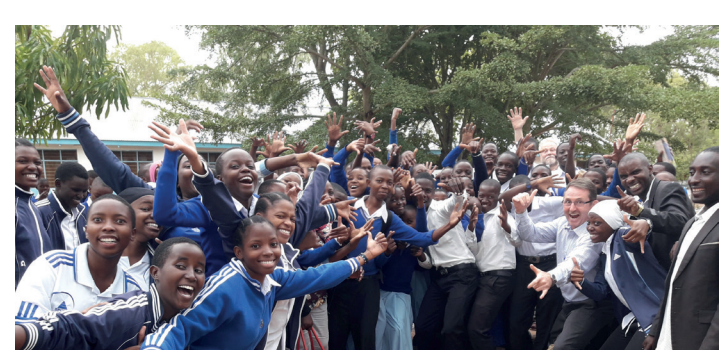
Fema Club

In the absence of real progress on job creation, the large, connected and increasingly well-educated youth in East Africa may join the irregular migration routes to Europe. Radicalisation of youth is also a risk in the medium term, with both the EU and UN planning to support Tanzania in countering violent extremism.