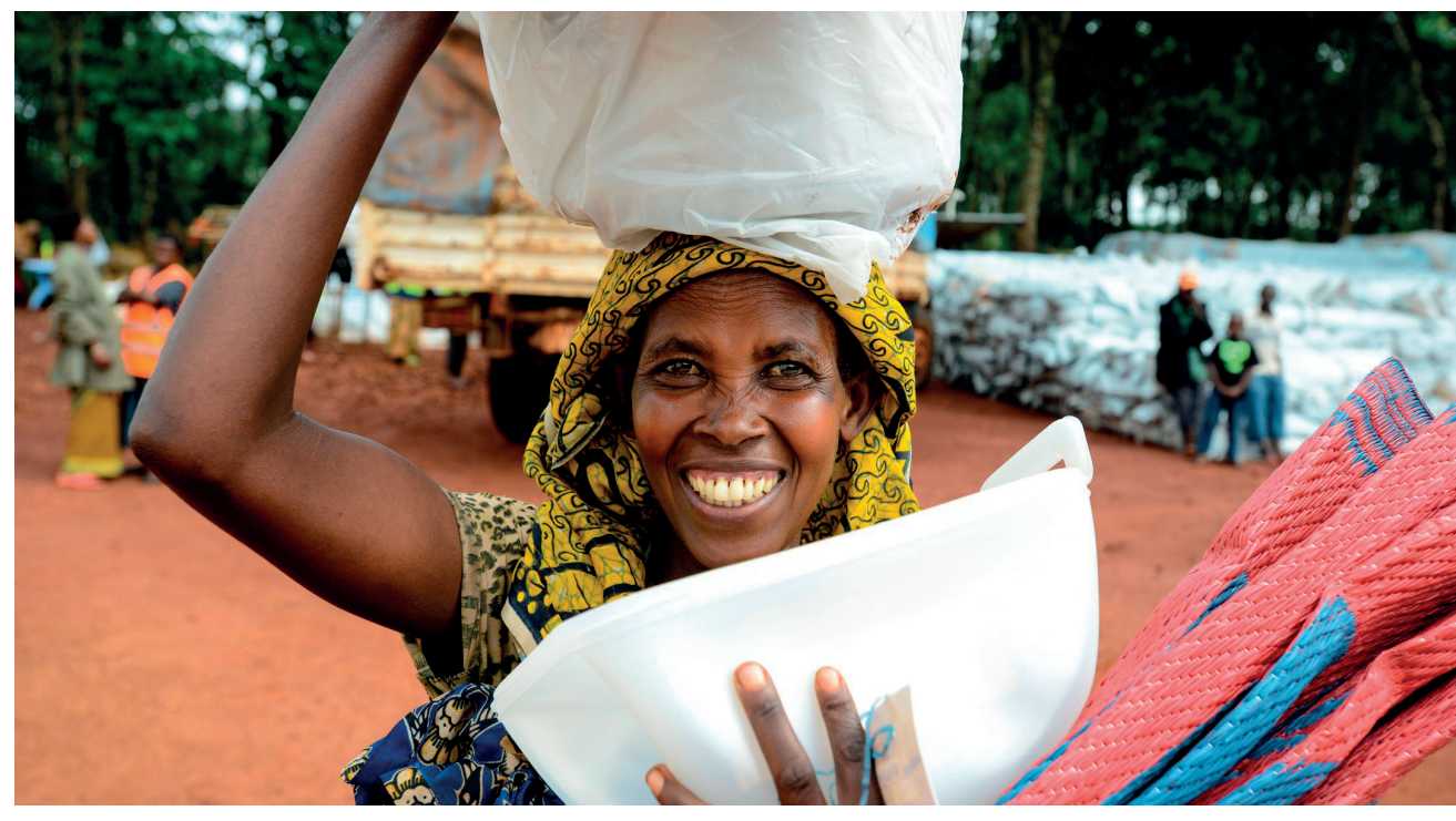
A woman receives Non Food Items (NFIs) in Nduta refugee camp.