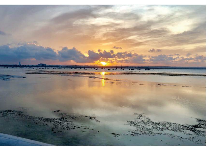
Sunset Dar es Salaam.

Enhanced people-to-people, business, and institutional links between Ireland,Tanzania, and the sub-region