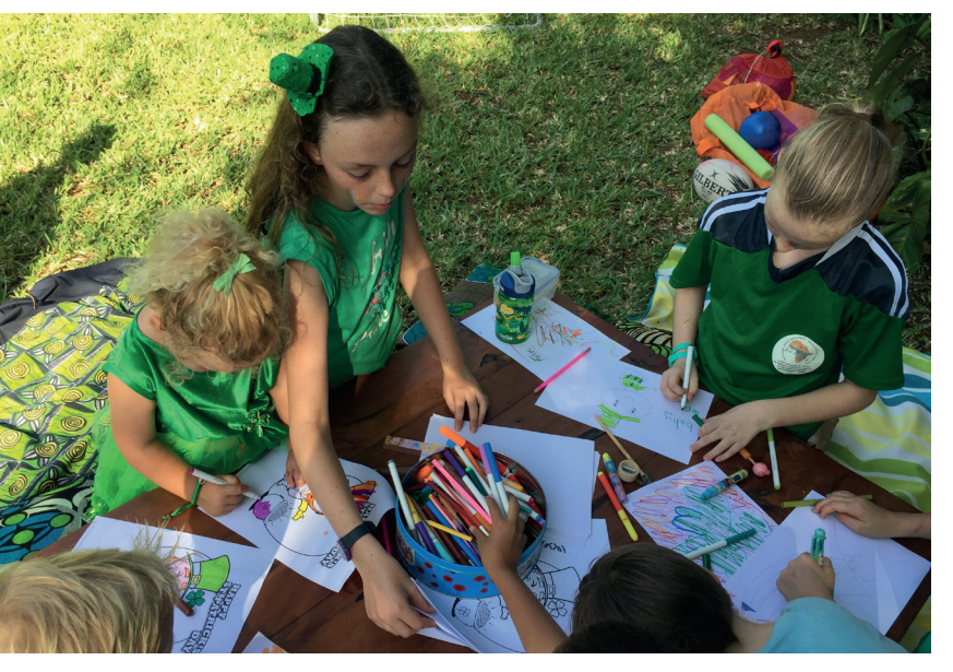
St Patrick's Day Children's Party.

Although modest in number, the Irish in Tanzania and the sub-region add a unique and diverse dimension to our relations with these countries. Some of our citizens are missionaries with long and enduring links; others have made the region their home; many more are serving in development and humanitarian organisations; and some are engaged in the private sector. Our wider Irish family includes Irish Alumni and people with social, cultural and political associations. The Embassy has a strong role to play in facilitating communication and connectivity that can evolve to match the needs of this ever-changing diaspora.