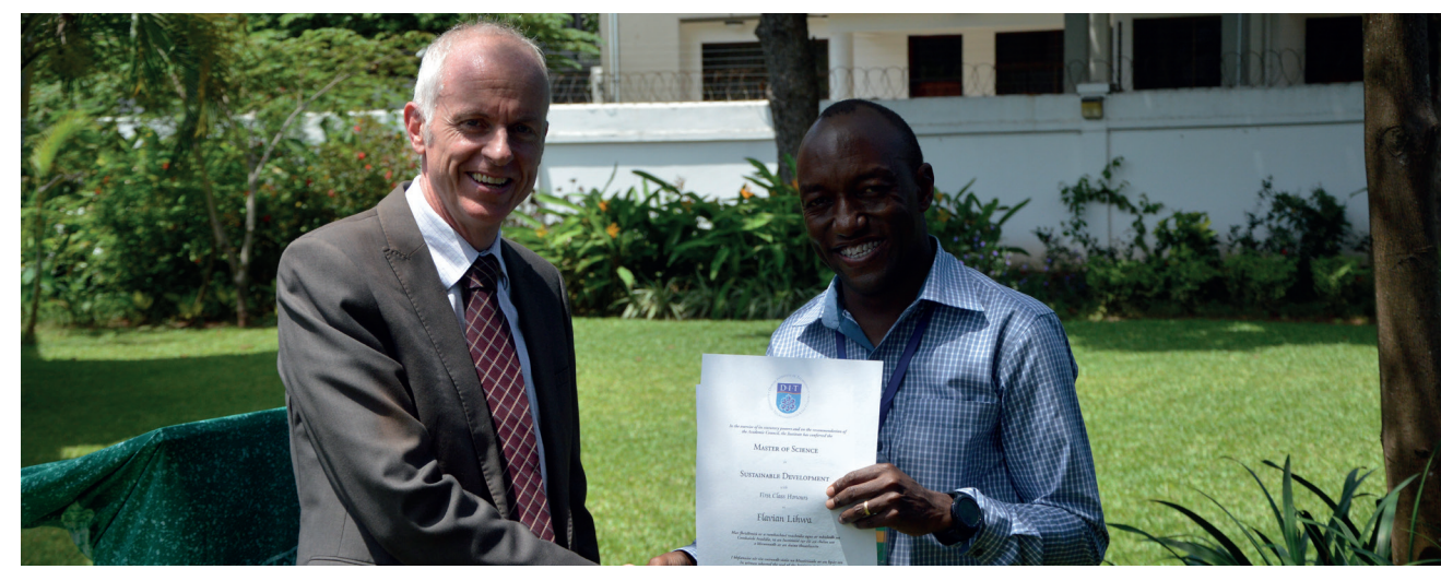
Fellowship alumni student award in Ireland 2017.